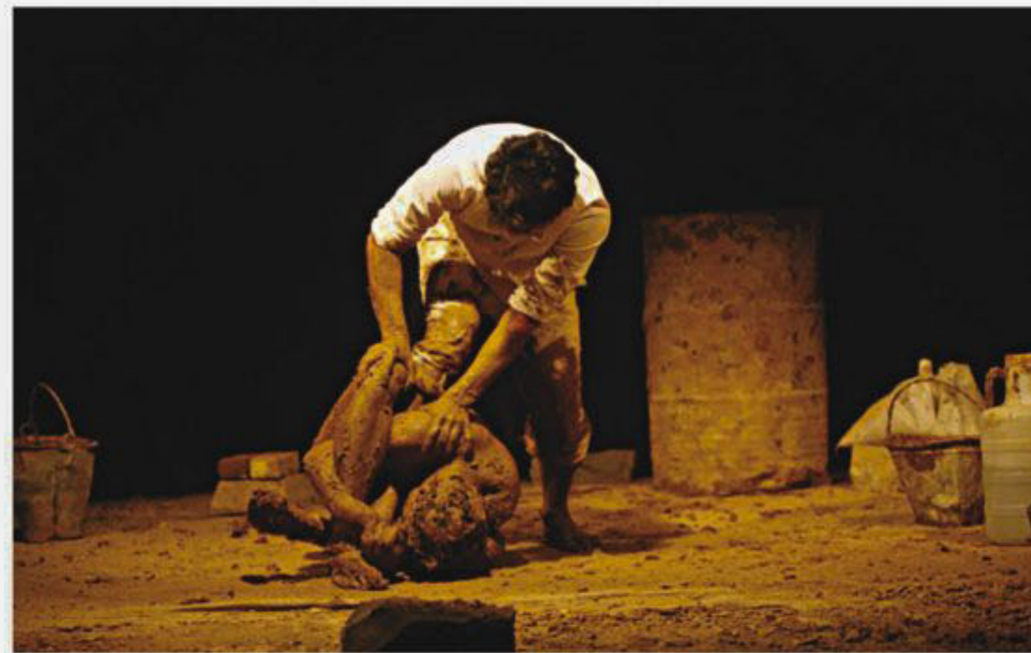
(Top) Children at the art camp; A still from “Mud”.

honours to Robiul Alam from Chittagong-based group Tirjak, and performance of Theatre (Baily Road) play “Maya Nodi”. Iran’s Crazy Body Group was formed in 2005, with some motivated and energetic people in local and international realms of performing arts looking to communicate with people of every culture, language and nationality. The group terms itself an intimate mixture of the arts: martial arts, drama, music, visual, photography and costume. Their style incorporates various elements contemporary mime and physical theatre, and is very strongly based on body and movement. Their production “Mud” is an intense, at times visceral drama that uses lights, mud and other props along with contemporary physical to a stunning visual effect.