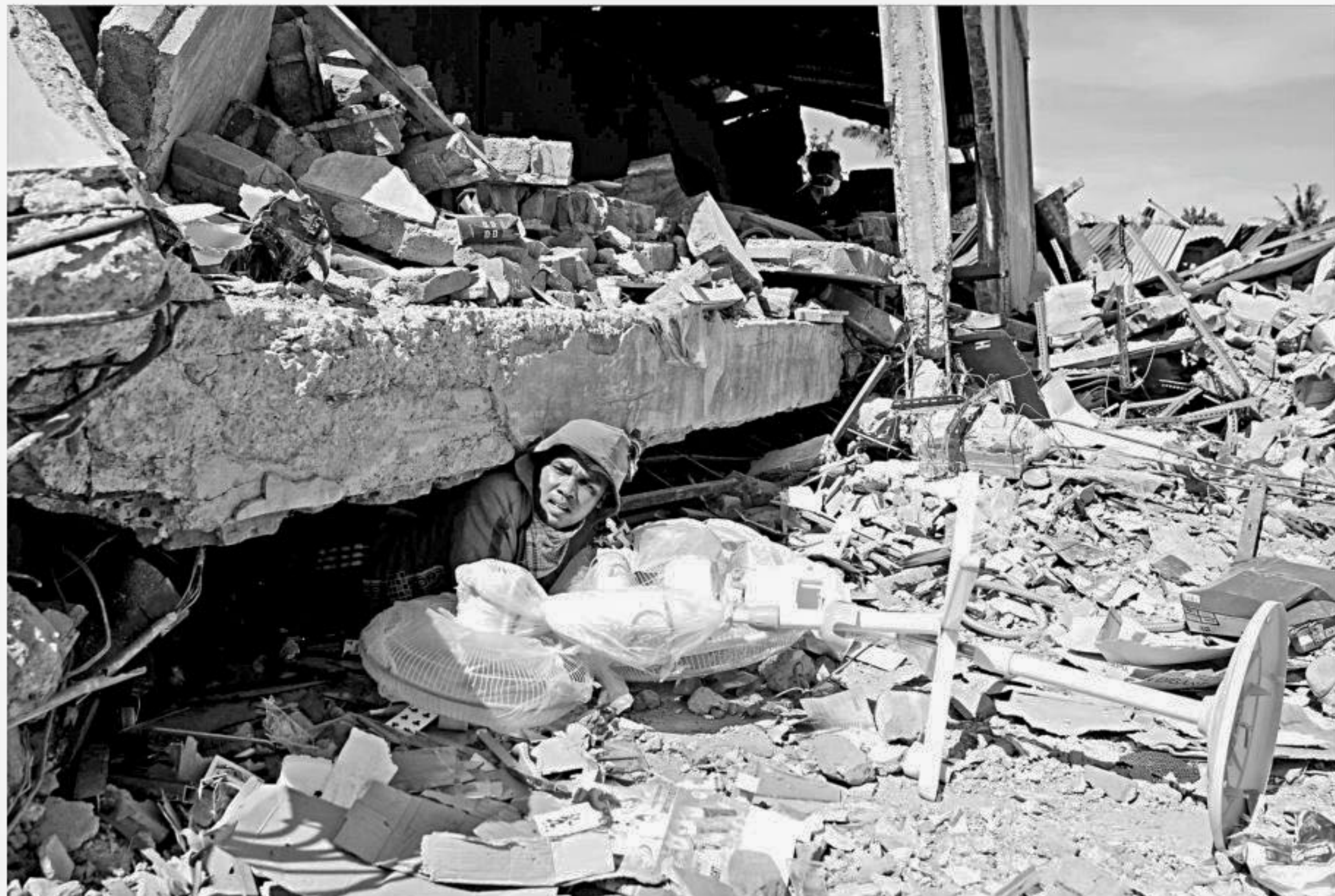
A man retrieves belongings from a collapsed shop following a strong earthquake in Meureudu, Pidie Jaya, Indonesia, yesterday. Humanitarian organizations descended on Aceh province as the local disaster agency called for urgent food supplies and officials raced to assess the full extent of damage.

An 18-year-old Palestinian threatened Israeli border police with a knife at a flashpoint junction in the occupied West Bank yesterday and was shot dead, Israeli authorities said. The incident occurred at the Tapuah junction near the northern West Bank city of Nablus, police said.