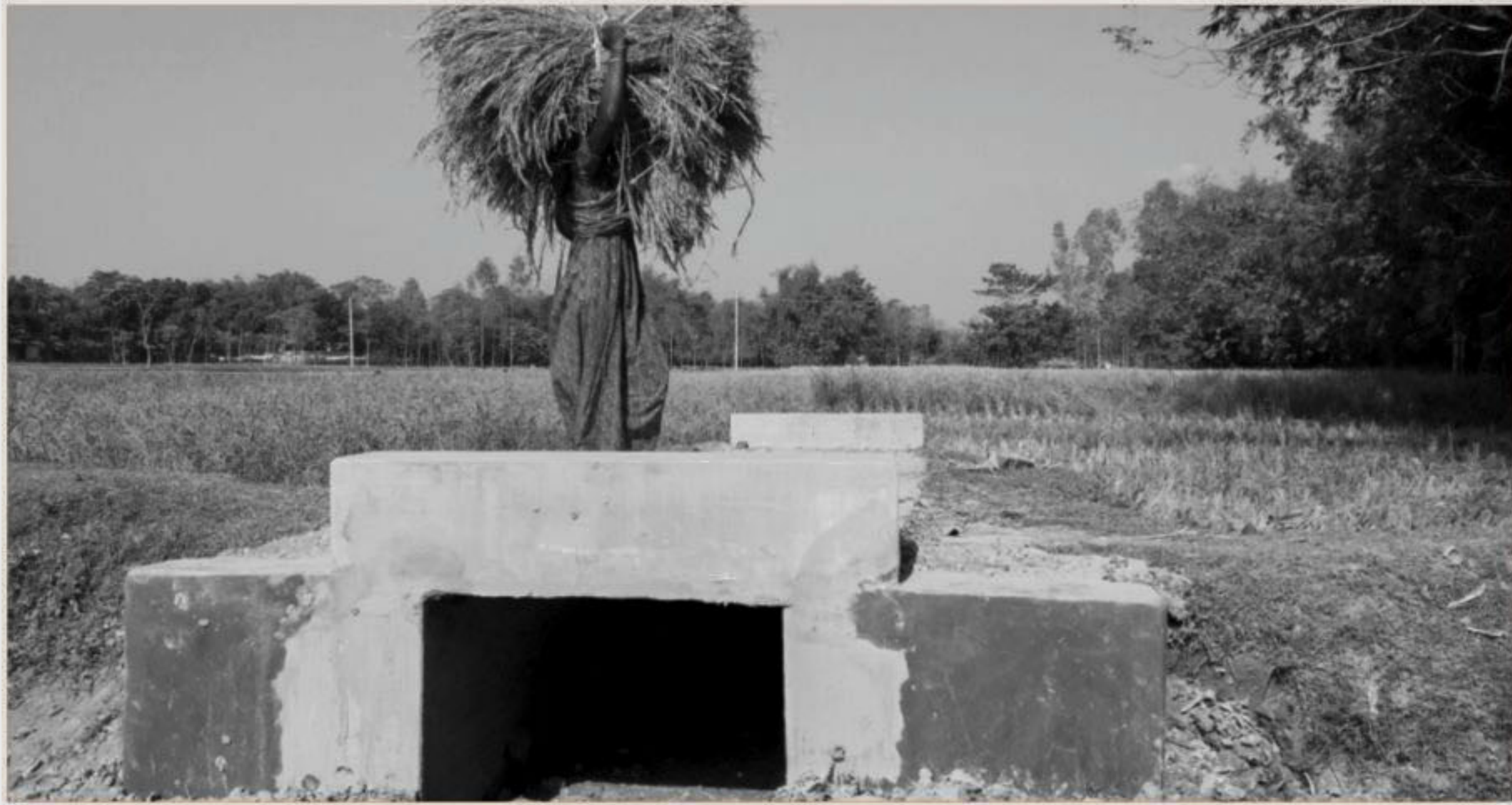
Cracks developed in a newly built U-drain that was repaired to cover up shoddy construction at former enclave Bhitorkuti in Lalmonirhat Sadar upazila. The photo was taken recently.