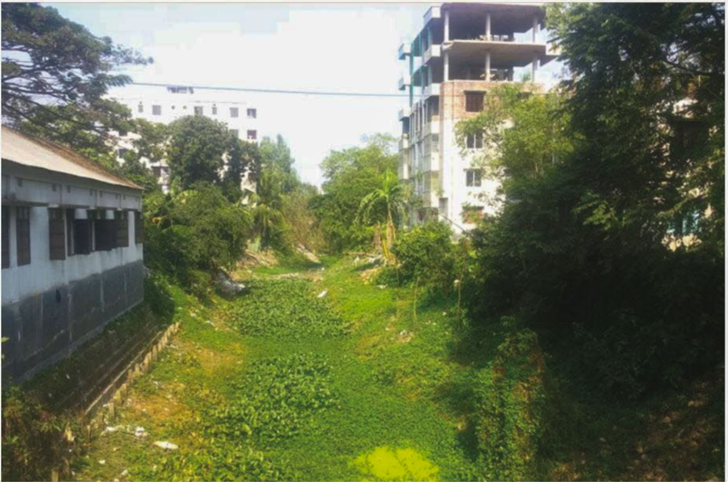
The canal locally known as Barukhali Khal flowing through the Mirzapur municipality area in Tangail is nearly dead due to mindless filling and encroachment.