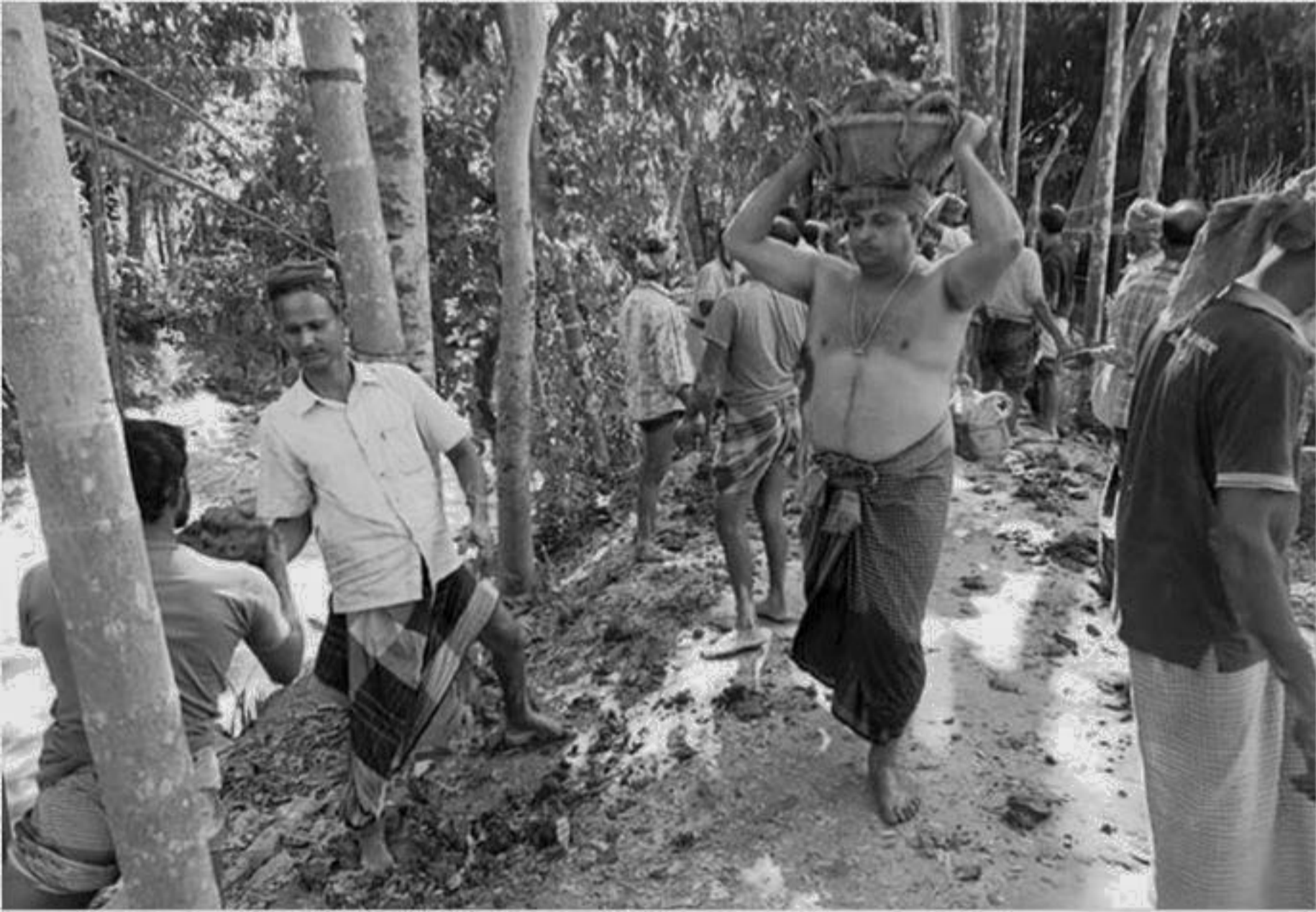
Villagers render voluntary service to build an embankment on Heulbunia canal in Barguna Sadar upazila last week.