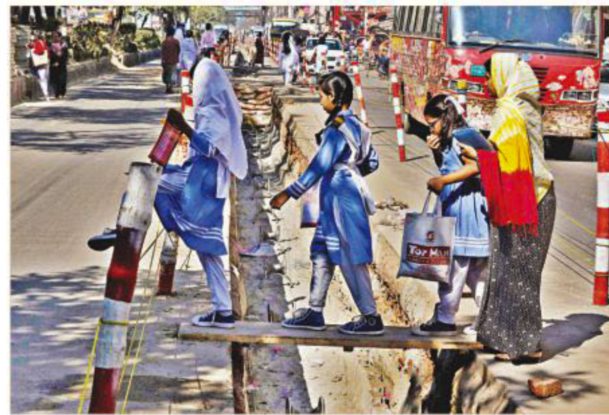
Utility lines being laid on Rokeya Sarani, on the stretch from Agargaon to the Mirpur 10 roundabout, in the capital as part of the construction of metro rail yesterday. Since the rearrangement is to go on till February before the excavation shifts to Pallabi, vehicles bear the long, slow queues and the absence of hard barriers while people the dirt and risks to get on with their daily lives.