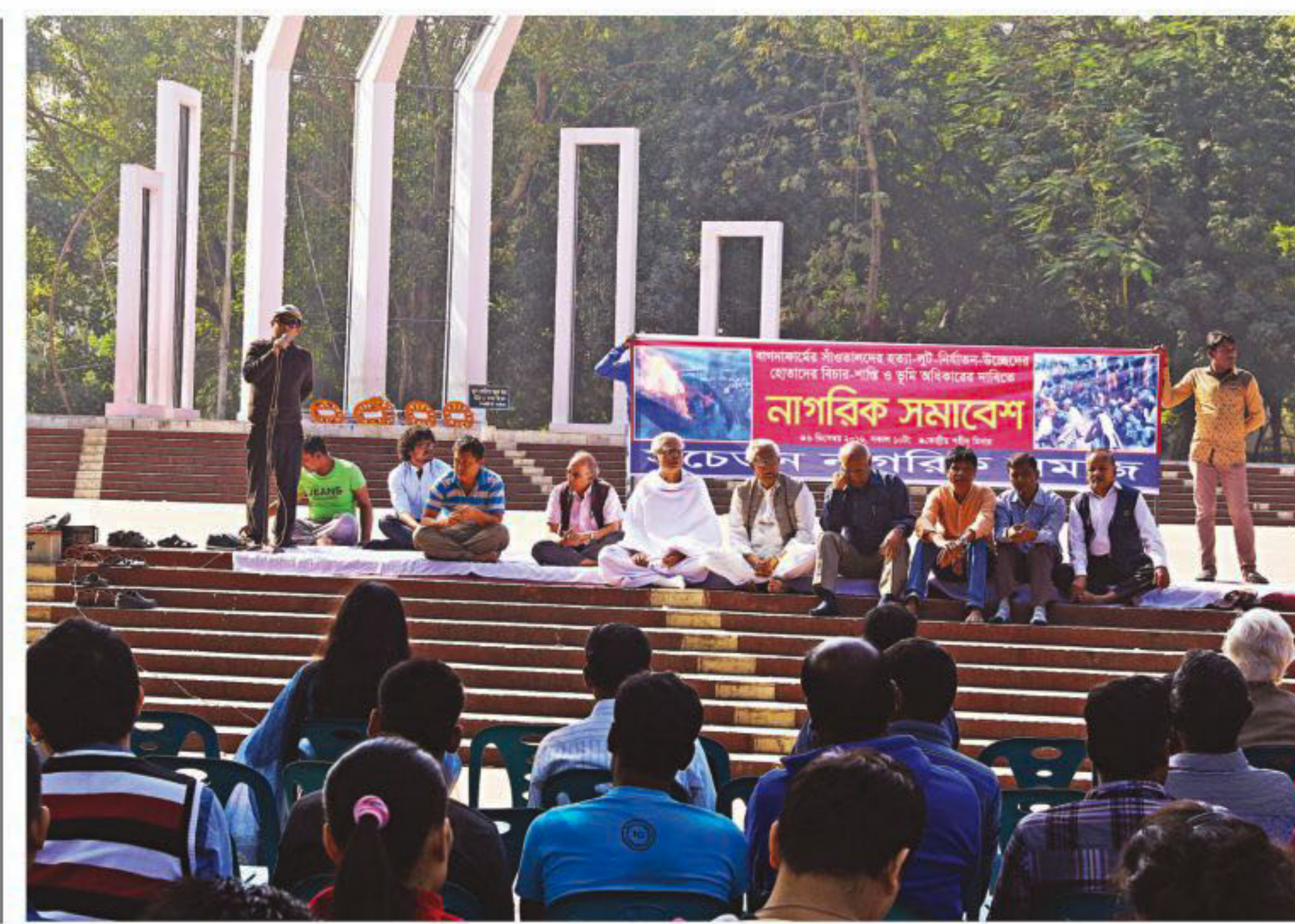
Nagorik Samaj organises a "citizens' rally" on the Central Shaheed Minar premises in the capital yesterday demanding restoration of the land rights of the Santal community in Gaibandha's Gobindaganj upazila.

Rab seized 22 mobile phones, one laptop, two modems, SIM cards, 3,500 Nigerian Naira, US$301, and Tk 1.41 lakh from them.