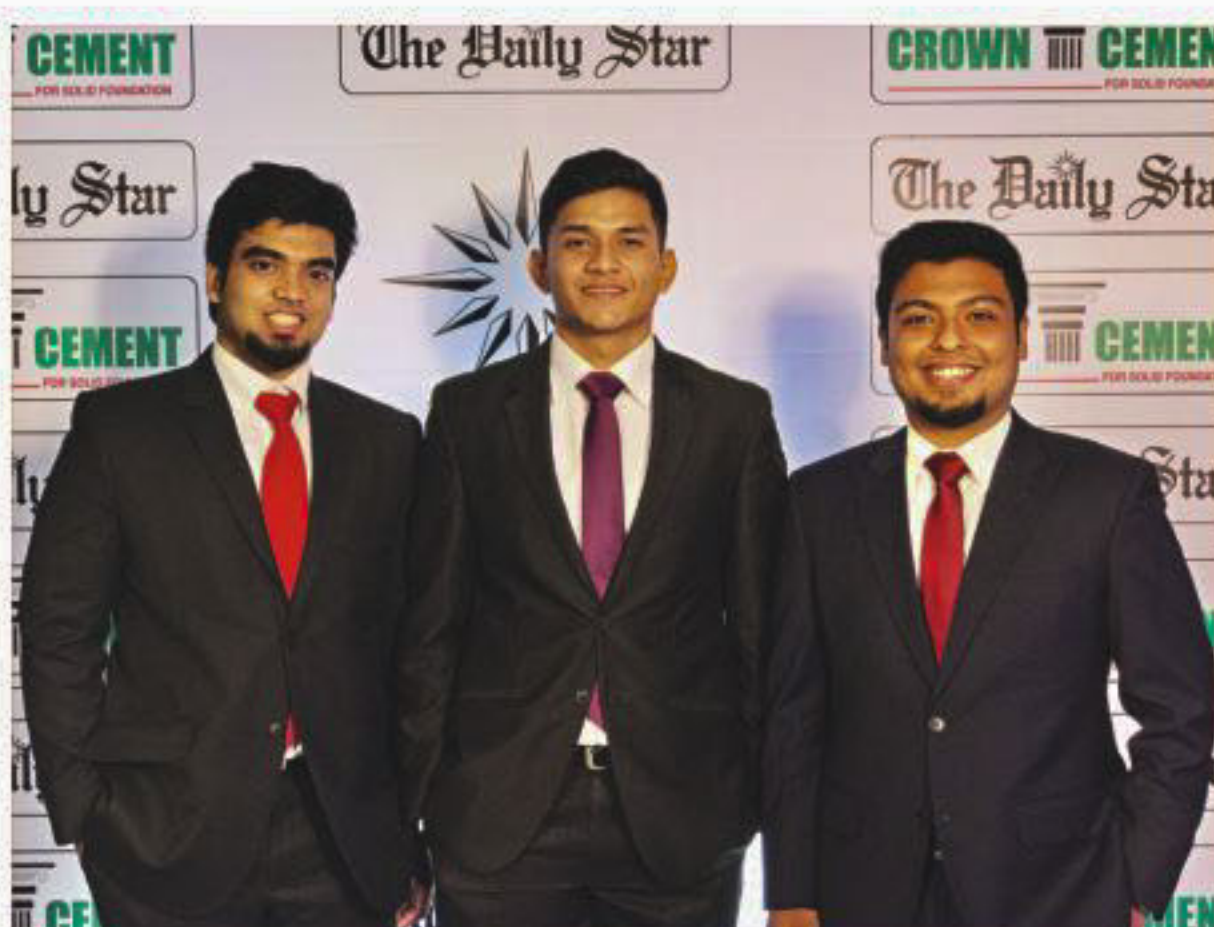
From left, Members of the winning teams -- Brains of Castamere, Inspirebels and Team Unpredictable -- pose for photographs at an event at Senamalancha in Dhaka on Saturday.