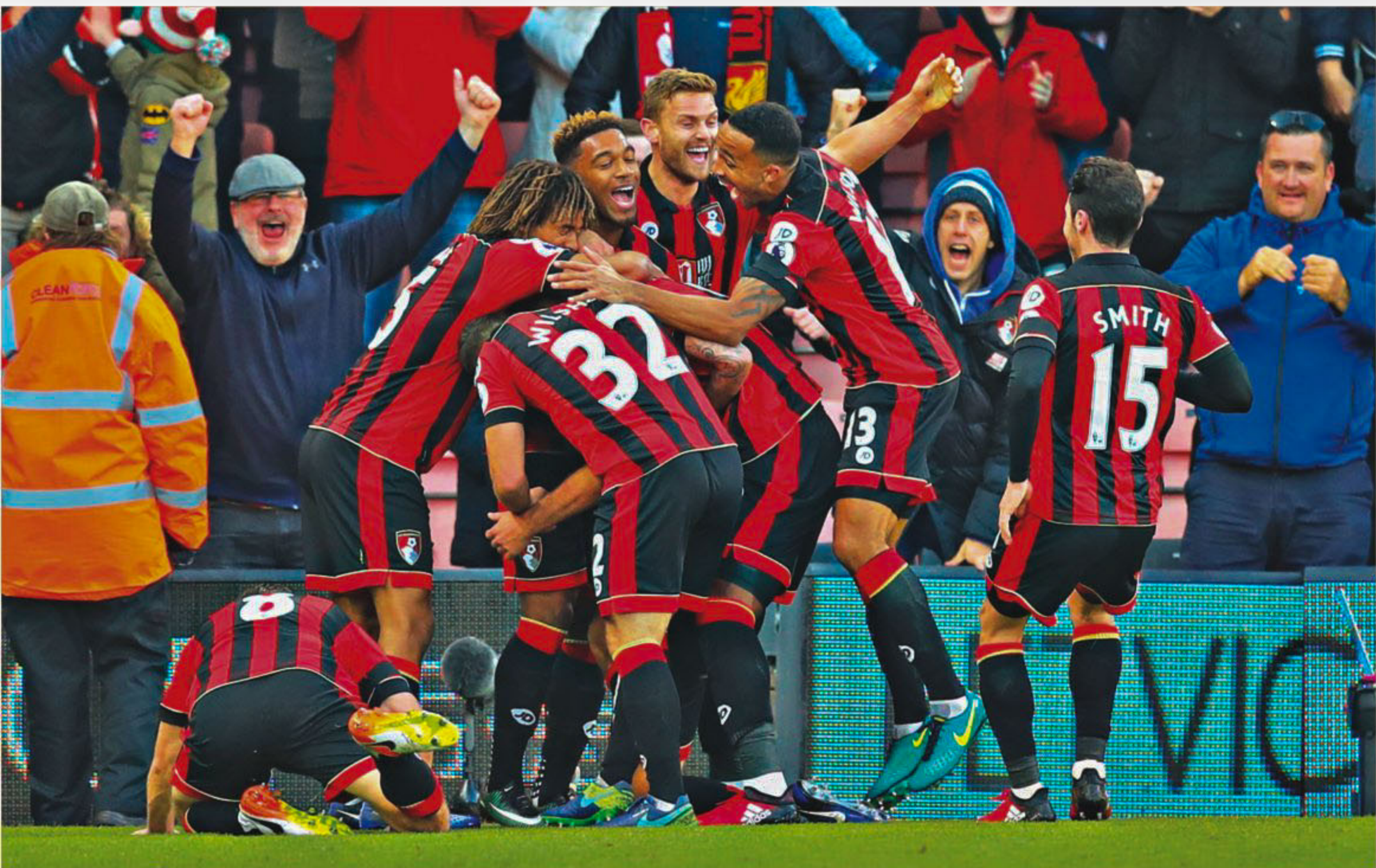
Bournemouth stunned even their own fans at the Vitality Stadium as they scored three goals in the final 15 minutes of their Premier League match against Liverpool to emerge 4-3 winners.