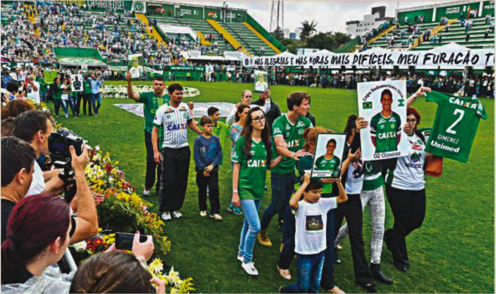
Relatives of the members of the Chapecoense Real team enter the field during a wake at the Chapeco stadium in Santa Catarina on Saturday.