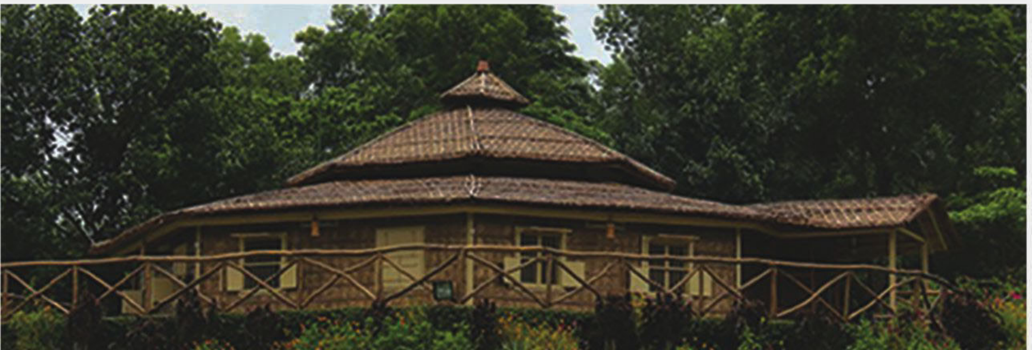
The bamboo house that will be the venue for the art camp.

The festival, running from November 24 – December 4 and the award ceremony are part of the Singapore Media Festival (SMF), hosted by the Info-communications Media Development Authority of