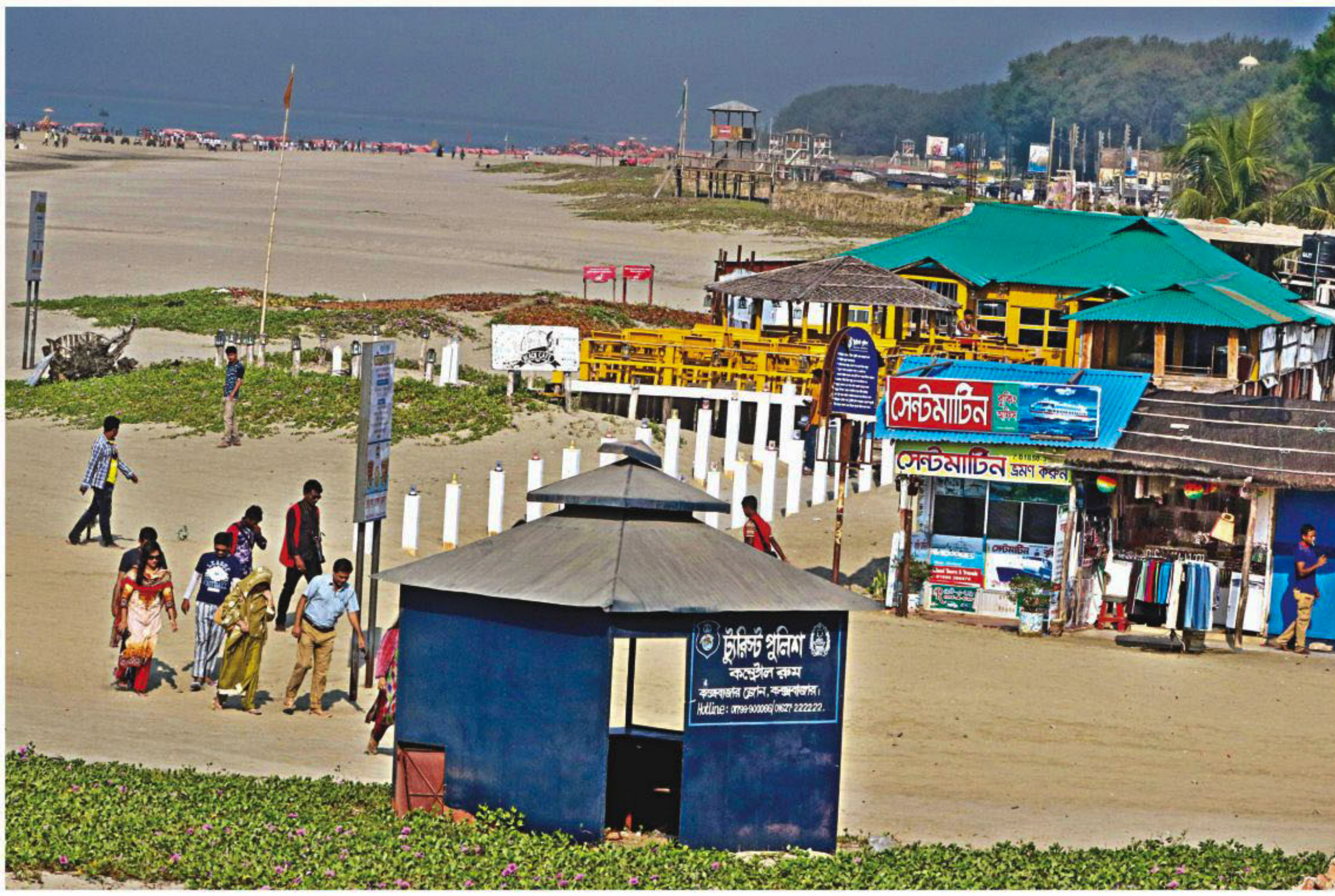
Business establishments have mushroomed on Kalatali sea beach of Cox's Bazar though the place is an ecologically critical area (ECA) that should be free of any such structures. The photo was taken a few days ago.