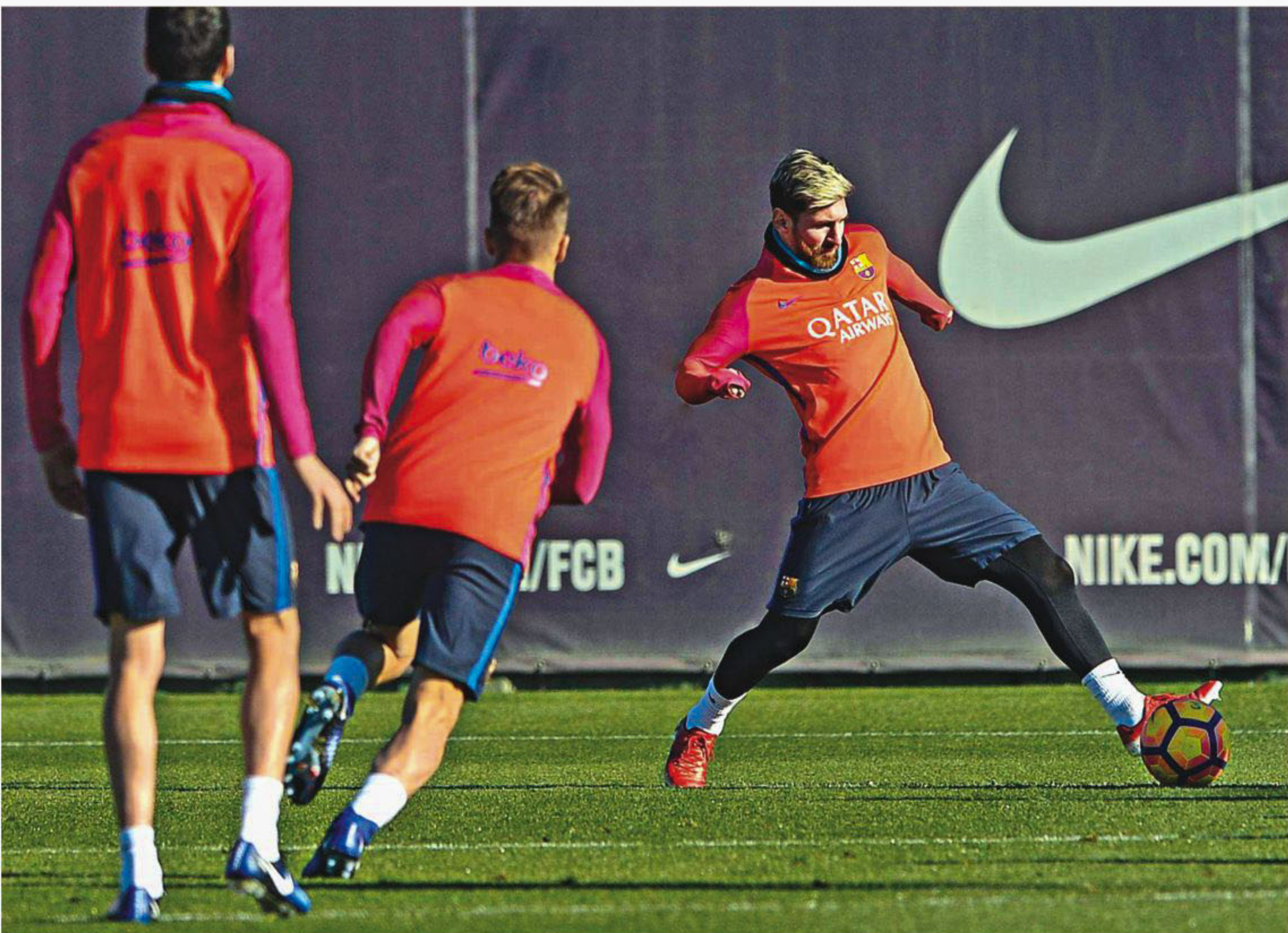
(L) Argentine sensation Lionel Messi and his teammates will be looking to turn Barcelona's flagging fortunes around when the defending champions host league leaders Real Madrid, spearheaded by Portuguese superstar Cristiano Ronaldo (R), for the first Clasico of the La Liga season at the Nou Camp tonight.