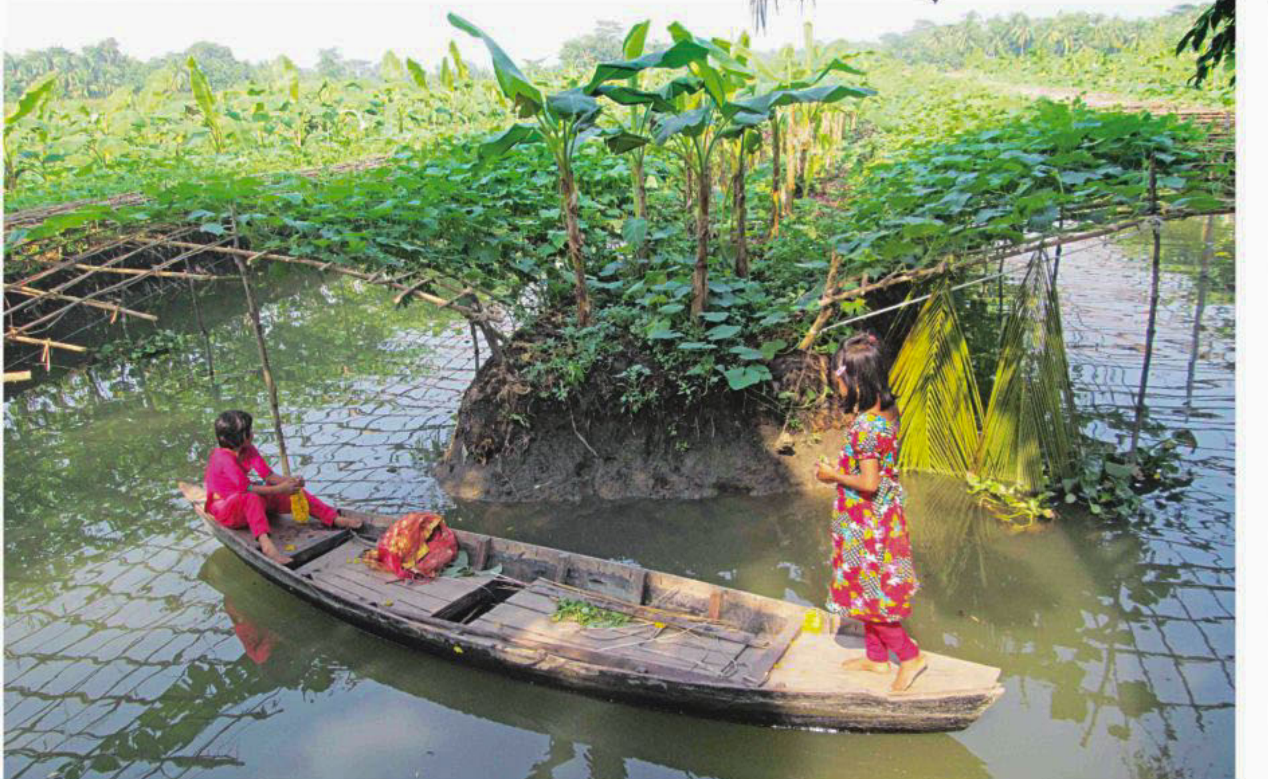
Children on a boat taking a look around the verdant surroundings when making garlands with flowers they plucked from cucumber plants of a vegetable garden in the saturated land in Pirojpur's Nazirpur upazila. Villagers grow different varieties of vegetables in wooden platforms over the land, which stays underwater all year round. The photo was taken at the upazila's Mugarjhor village recently.