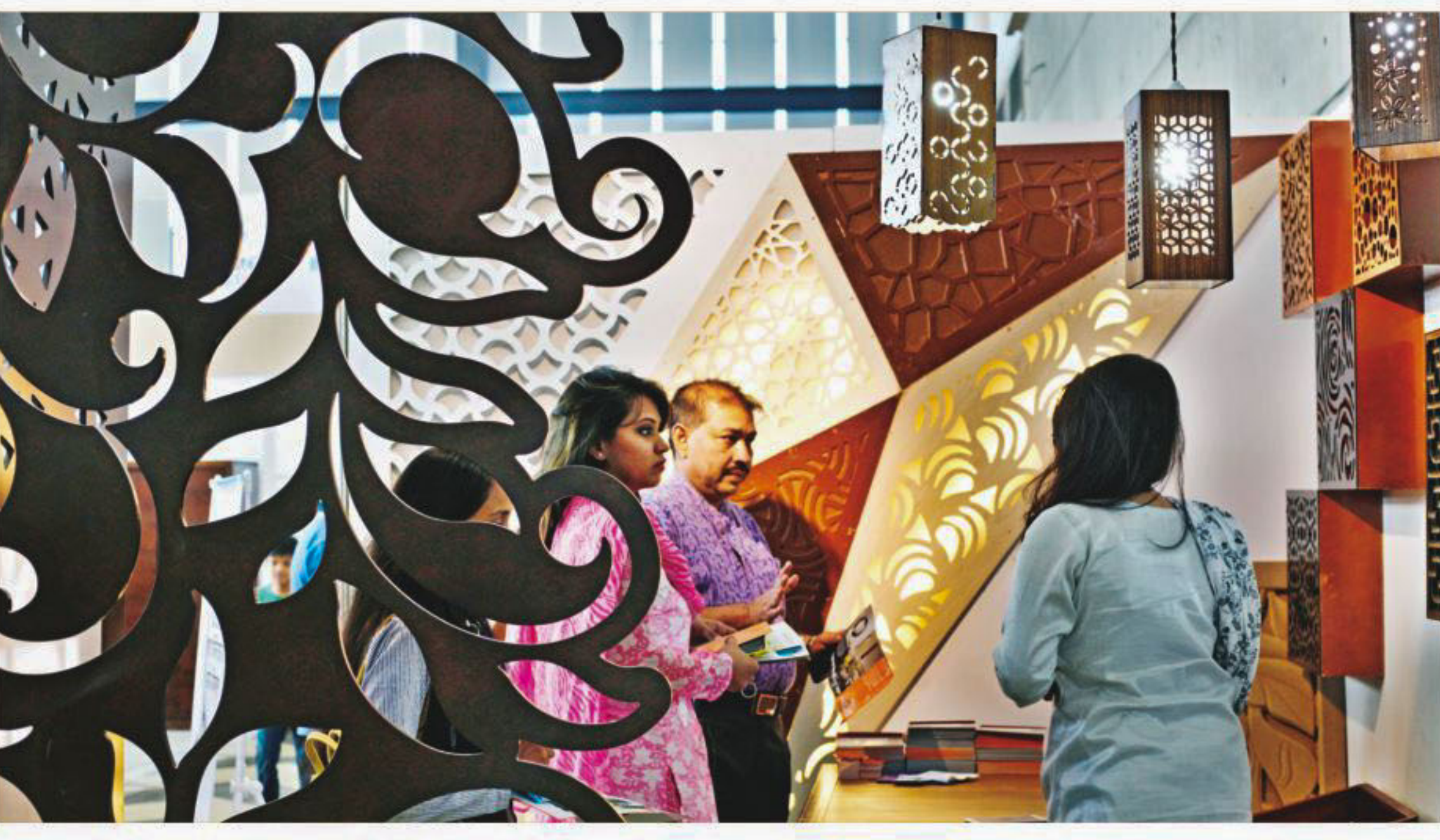
Visitors at a home decor expo in the capital's Bashundhara International Convention Centre titled "Home Fest Dhaka - 2016" yesterday, organised by Windmill Advertising Limited.