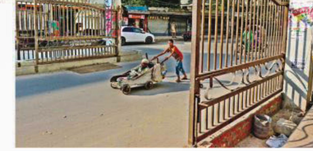
A worker puts the final touches on an iron gate in the capital's Segunbagicha beside the office of the Ministry of Foreign Affairs yesterday noon. Around 16 of these gates will be set up at different points of the area along with private security guards by the local ward councillor to "ensure public safety and restrict entry of unwanted outsiders", according to the contractors. But these gates not only narrow down the road but also make pedestrian and vehicle movement troublesome. Inset, one of the gates in front of the Bangladesh Tariff Commission.