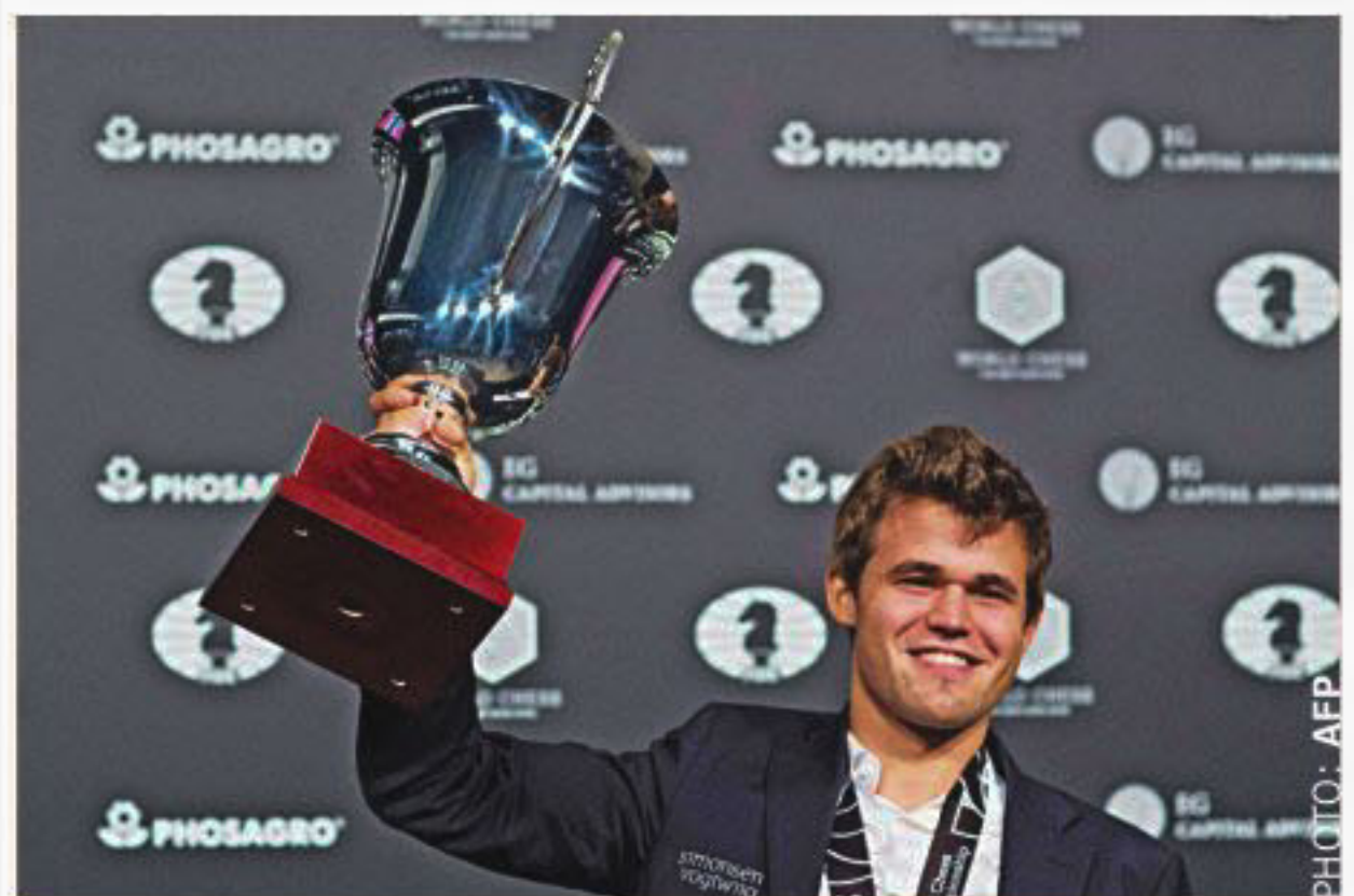
Norwegian Grand Master Magnus Carlsen holds up the World Chess Championship trophy after beating Russian counterpart Sergei Karyakin in New York on Wednesday.

"Sergei has impressed everyone with his tenacity these last few weeks so he is perfectly capable of pulling an upset," said Wesley So, who travelled to New York from Minnesota to watch the clash.