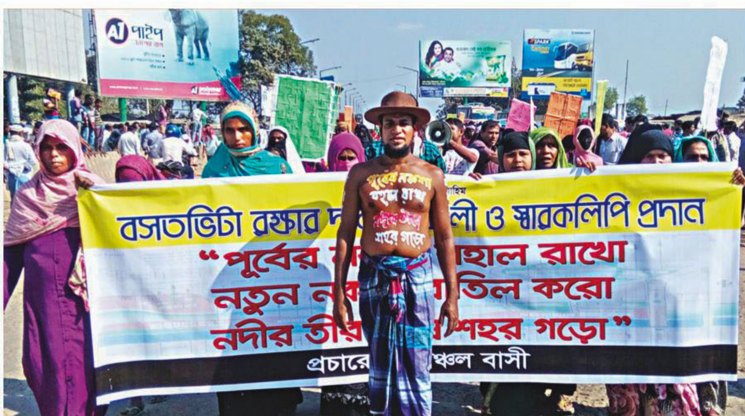
A procession brought out by residents of seven Mymensingh villages in the town's Shambhuganj Bridge and heading towards the deputy commissioner's office yesterday protesting alleged government plans to acquire some 4,366 acres of land in char areas in the sadar upazila, which they claimed would lead to loss of ancestral homesteads and croplands, and urging to make use of khas land instead.