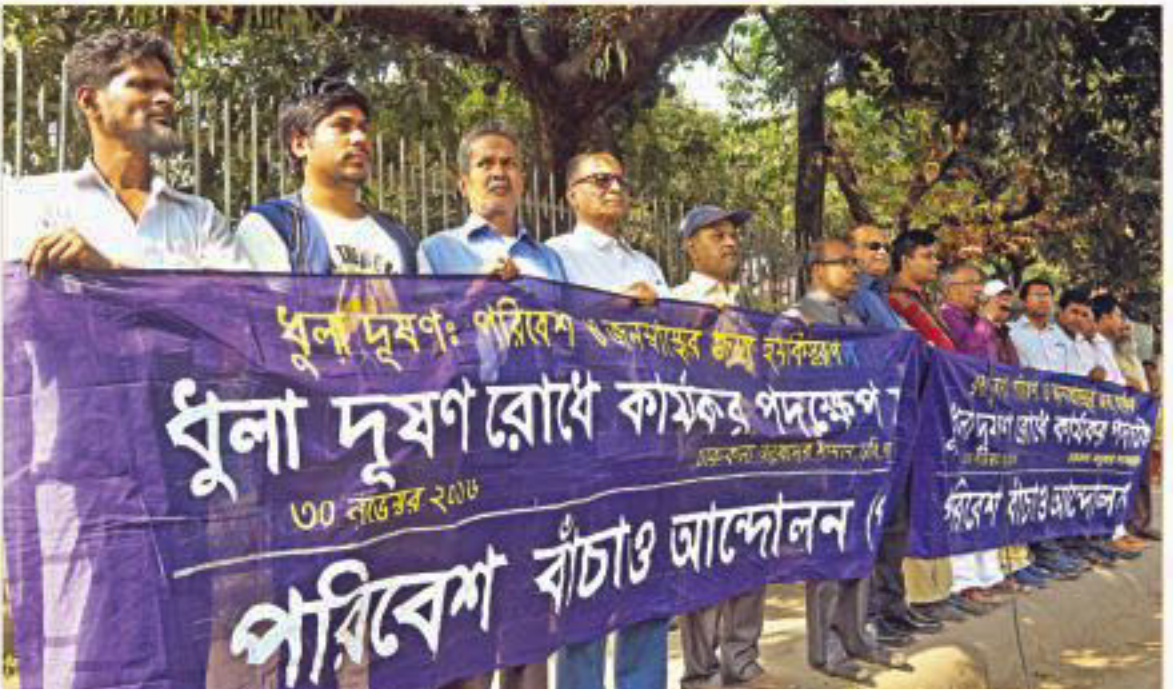
Poribesh Bachao Andolon (Poba) forms a human chain in front of Dhaka University's Faculty of Fine Arts yesterday, demanding immediate steps to check dust pollution.

Vice Chief of the Air Staff, Indian Air Force Air Marshal Birender Singh Dhanoa yesterday called on Chief of Air Staff, Air Chief Marshal Abu Esrar at Air Headquarters in Dhaka. During the meeting, they exchanged greetings and discussed different issues related to bilateral interests, said an ISPR press release.