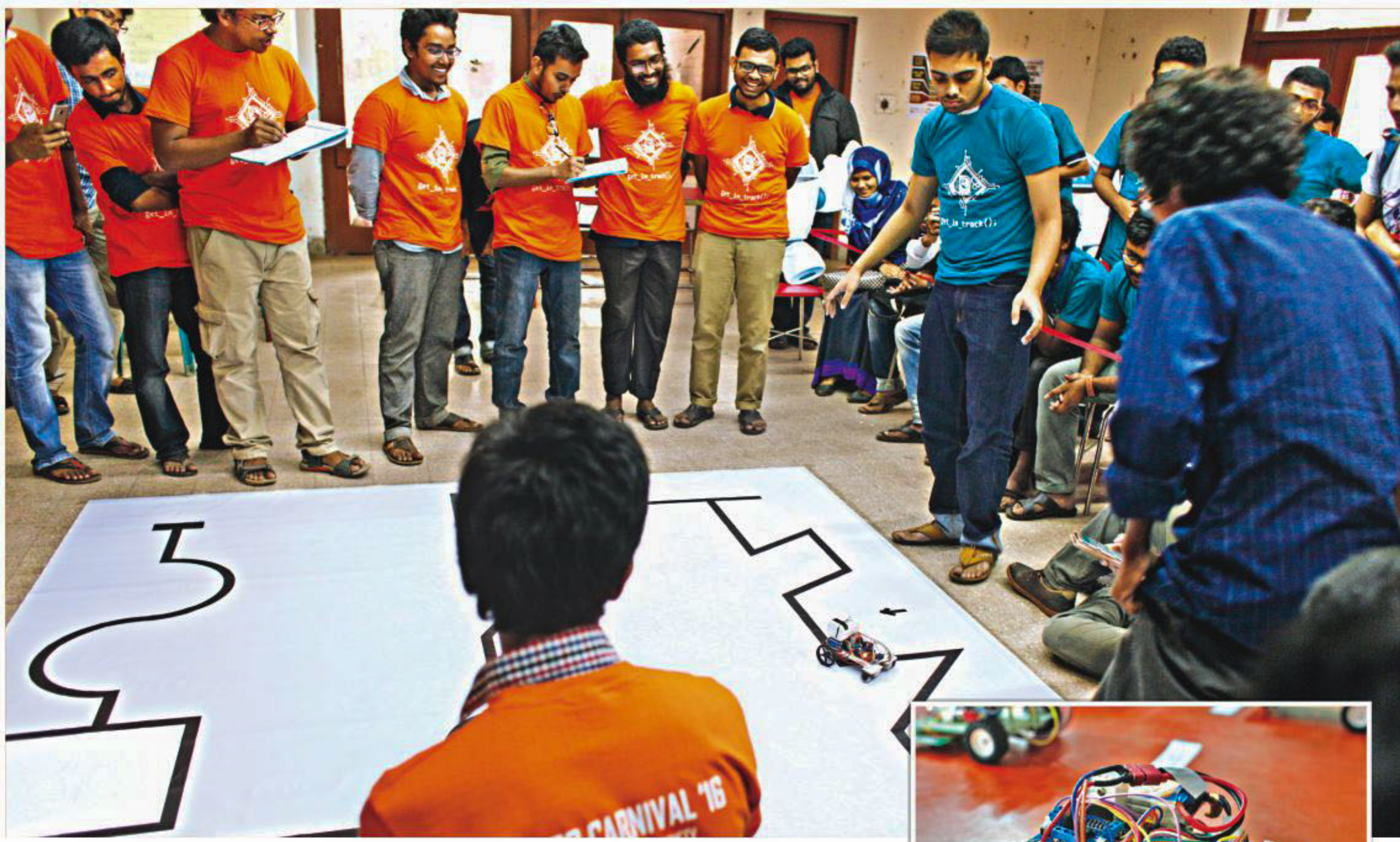
Some of the science, technology and engineering students of 15 universities who exhibited the prowess of their robotic creations at a three-day ROBO Carnival 2016, organised by Buet Robotics Society on the campus of the Bangladesh University of Engineering and Technology (Buet) in the capital from Tuesday. Inset, one of the brainchildren of the young innovators.