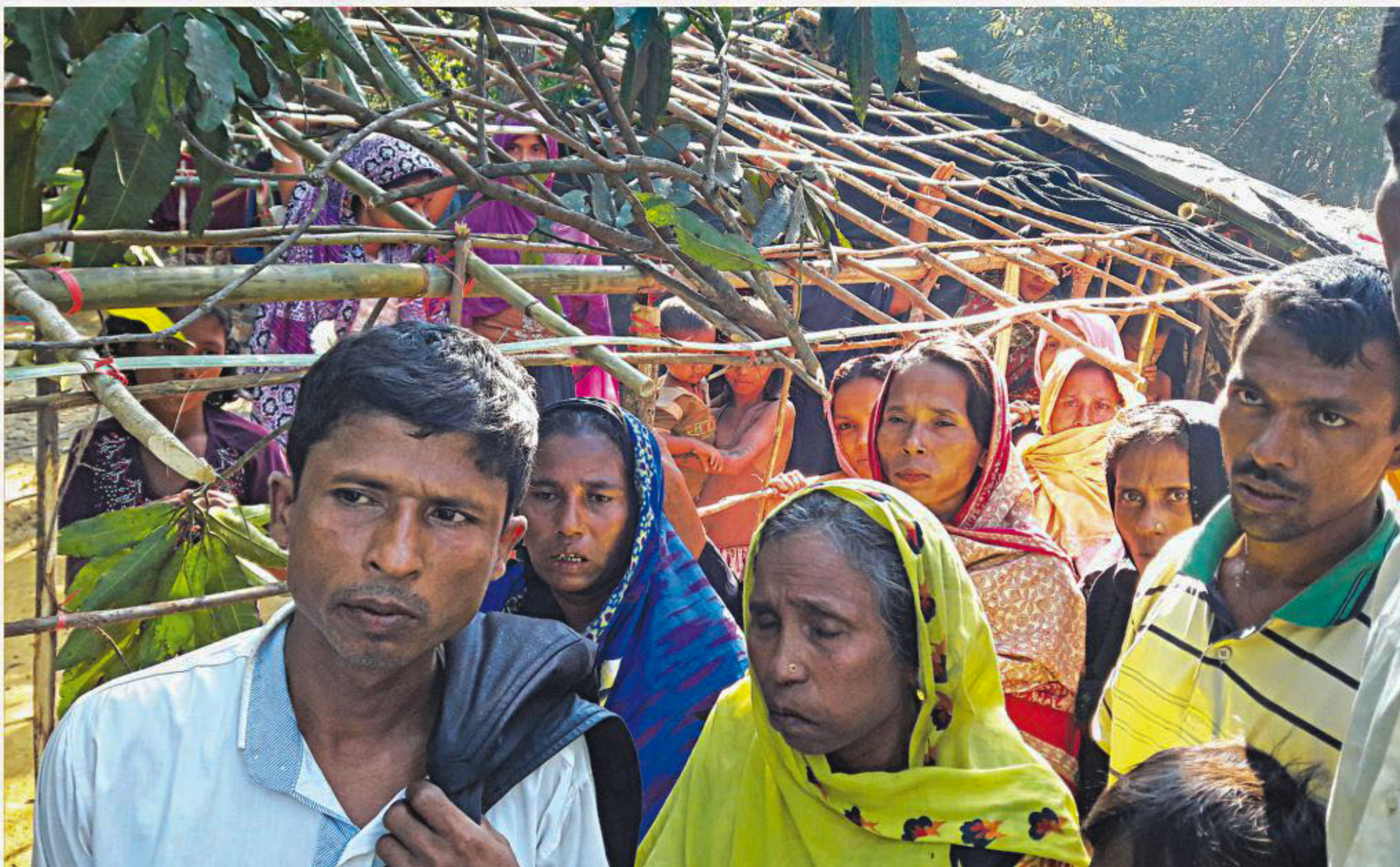
These Rohingyas have crossed into Bangladesh recently and started building makeshift houses at Kutupalang Rohingya camp in Cox's Bazar. Despite heightened vigilance by BGB personnel, Rohingyas continue to pour into Bangladesh to escape persecution in Myanmar. The photo was taken yesterday afternoon.