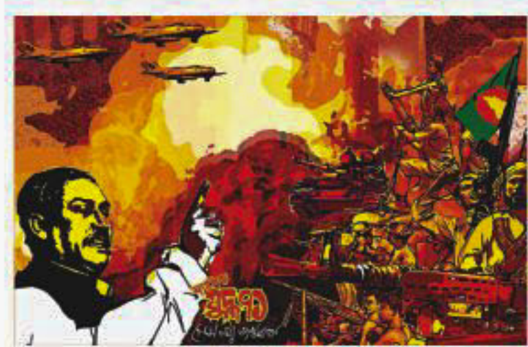
Up, a sequence of the game, "Massive War 71" and left, the cover photo of the war game expected to be launched in December.