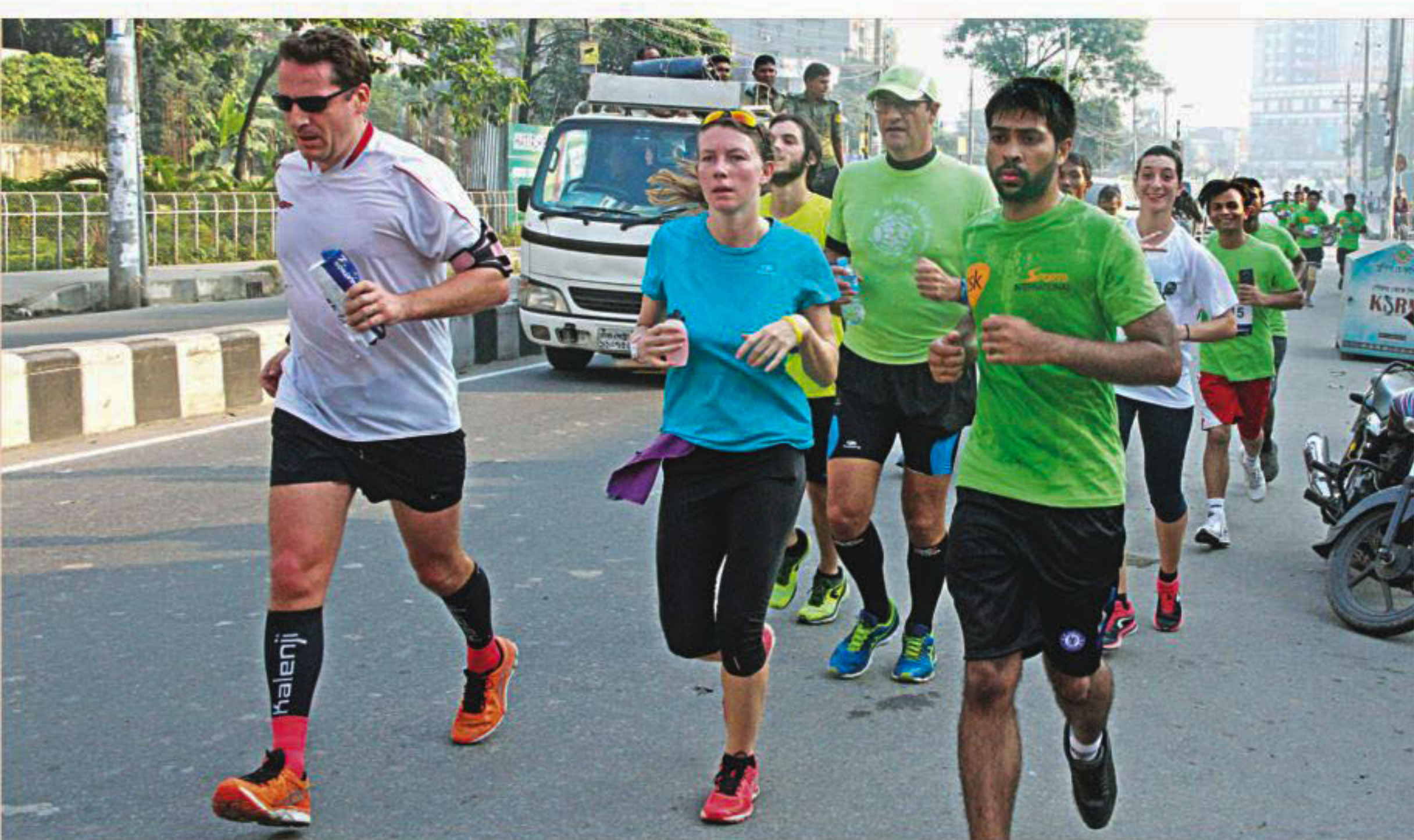
Thousands of participants, including numerous foreigners, lined up for the GSK Dhaka Half Marathon 2016, which was held yesterday morning. The 21.1km race began in the capital's Rampura Bridge, and the participants went around the city before reaching the finish line at the Manik Mia Avenue. The Daily Star was the youth engagement partner of the programme.

In reply, the West Indies were 124 for five in the 29th over when rain returned to bring the match to a premature end, leaving them short of the Duckworth-Lewis equivalent.