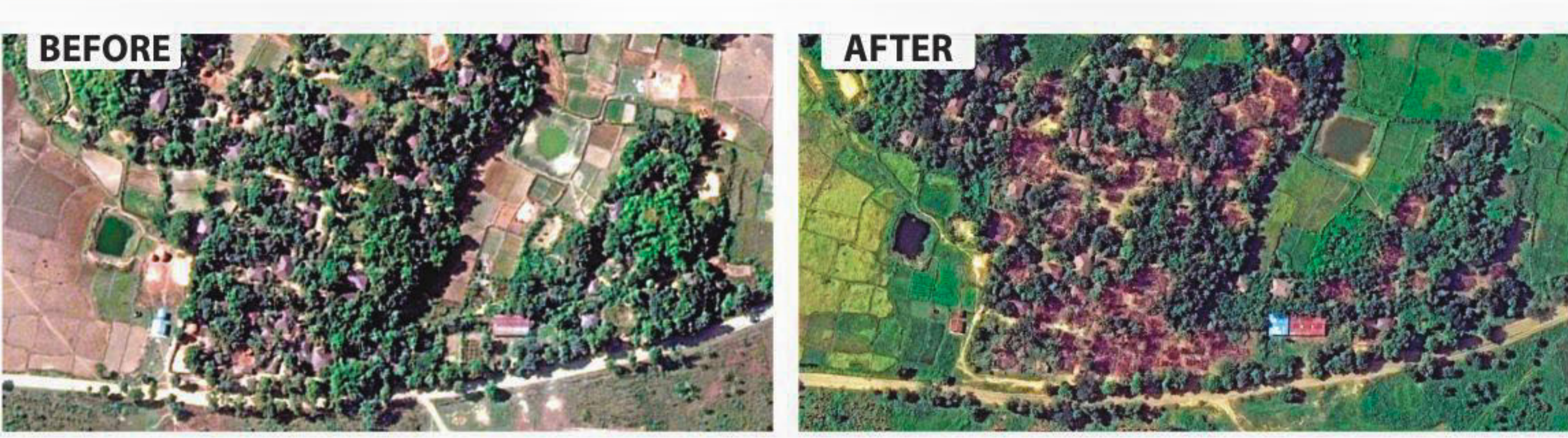
Ethnic Rohingya refugees use a shoe to hit a placard with portrait of Myanmar State Counsellor and Foreign Minister Aung San Suu Kyi during a protest against the persecution of Rohingyas in Myanmar, outside the Myanmar Embassy in Kuala Lumpur, yesterday. (Below) The satellite images released by Human Rights Watch show Wa Peik Village in Maungdaw District, Myanmar. The left picture was recorded in 2014 and the right one on November 10, 2016 show burnt out homes.