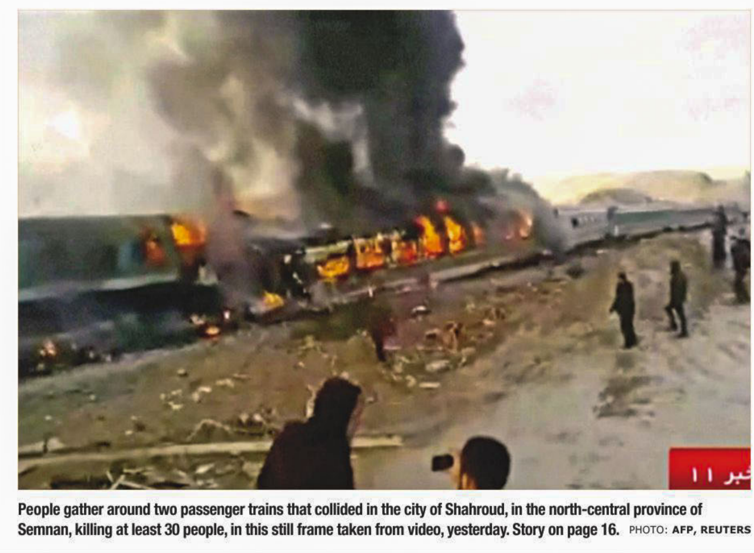
People gather around two passenger trains that collided in the city of Shahroud, in the north-central province of Semnan, killing at least 30 people, in this still frame taken from video, yesterday. Story on page 16.