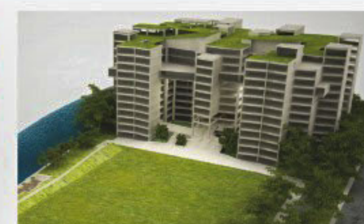
UIU Proposed Permanent Campus