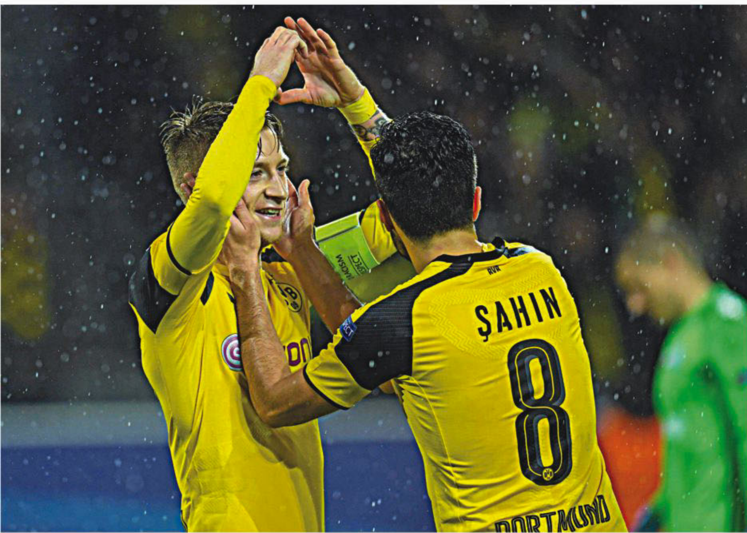
Borussia Dortmund forward Marco Reus (L) celebrates the first of his three goals with teammate Nuri Sahin during their Champions League encounter against Legia Warsaw in Dortmund on Tuesday.

Bangladesh Premier League Arambagh v Rahmatganj Time: 3:30pm Brothers Union v Abahani Time: 6:15pm Venue: MA Aziz Stadium, Chittagong