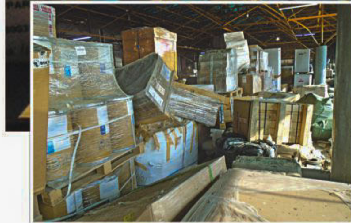
Goods are left out in the open at the cargo village of the Hazrat Shahjalal International Airport in Dhaka while other goods are stacked haphazardly, inset, in a shed of the airport last week. Security risks and poor scanning capabilities led to the UK, Germany and Australia banning direct cargo from Dhaka this year.