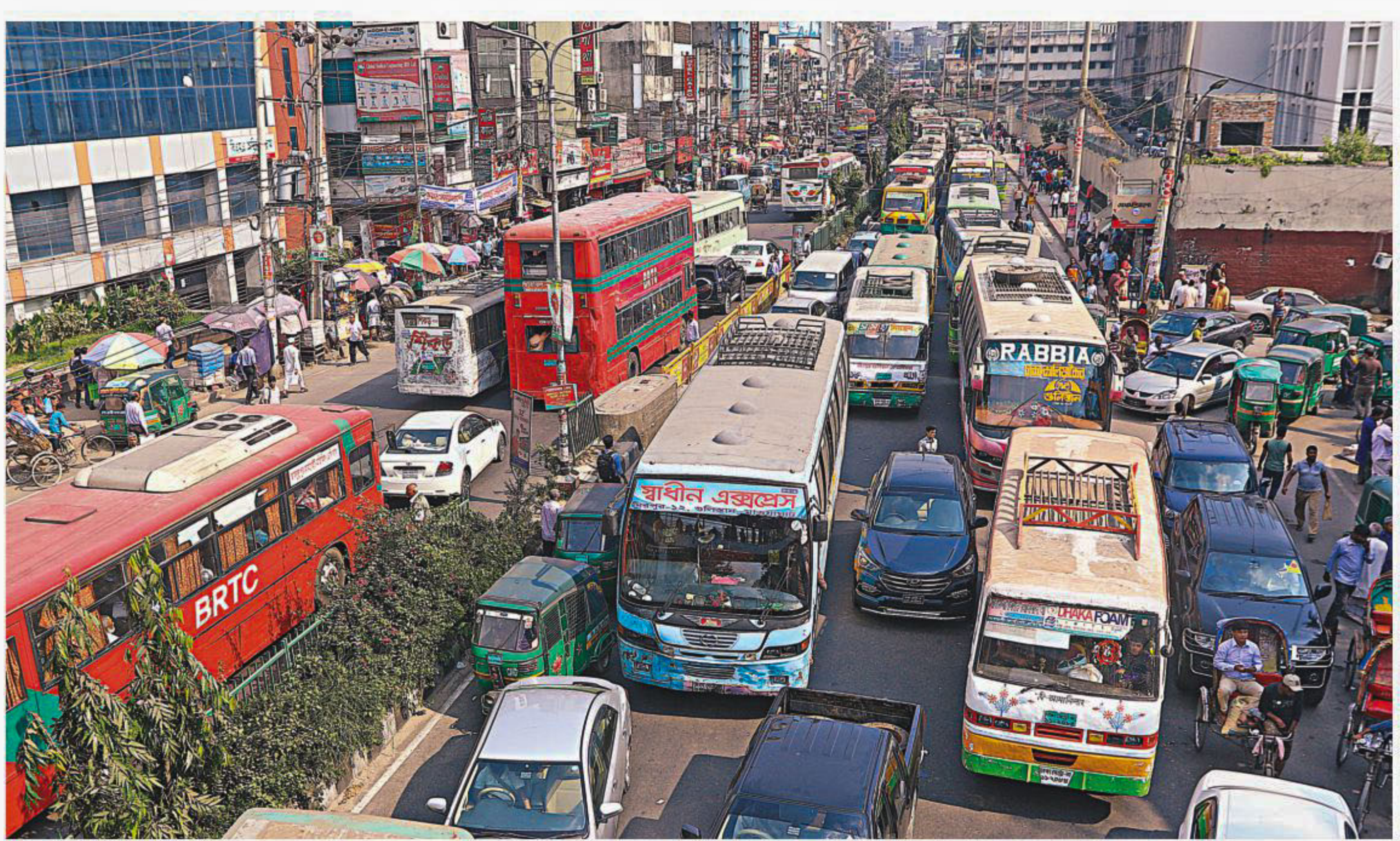
Drivers of buses use multiple lanes swerving left and right at their whim which leads to traffic congestion in the capital. The photo was taken on Topkhana Road at 11:00am yesterday.