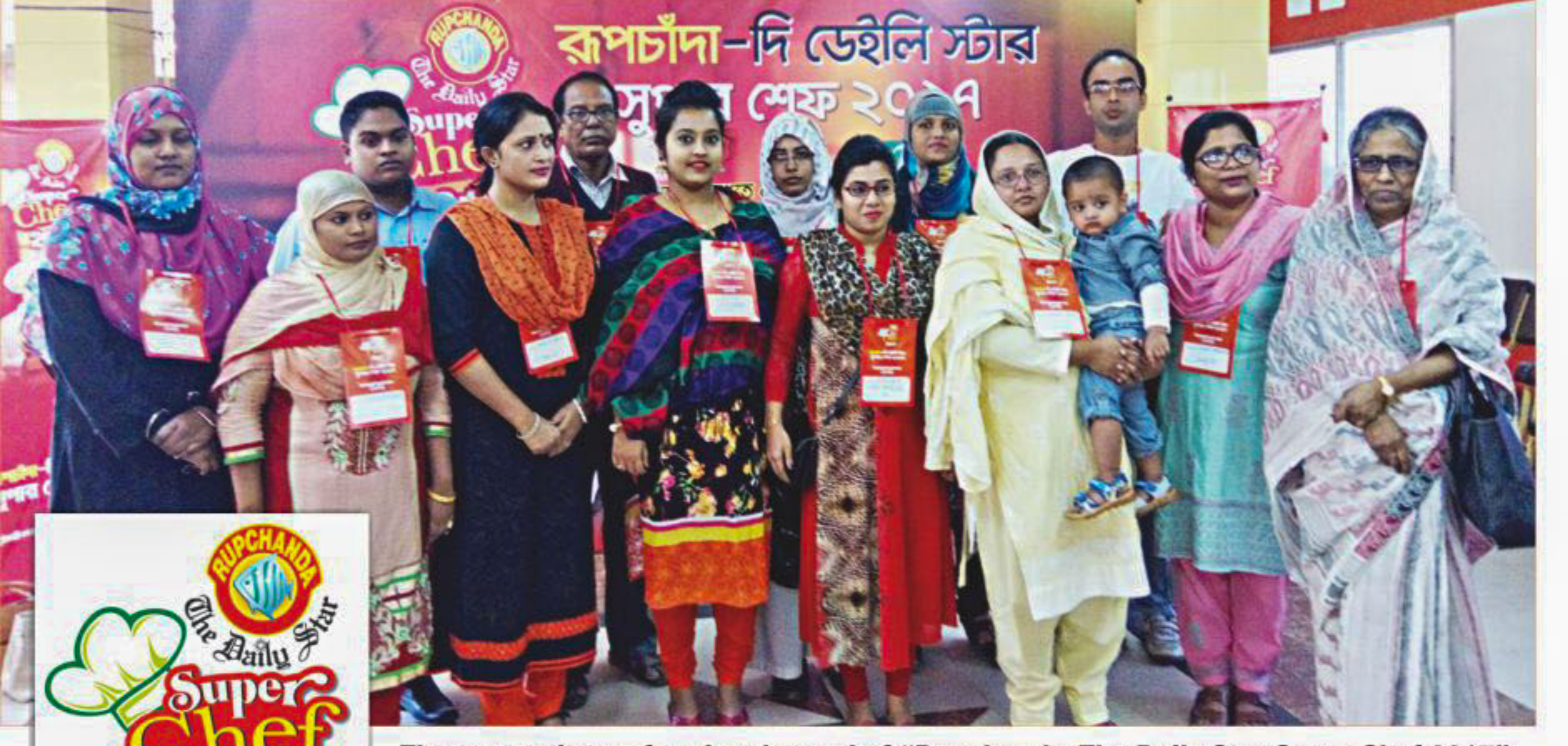
The competitors of regional round of "Rupchanda-The Daily Star Super Chef 2017" at a hotel in Mymensingh yesterday.