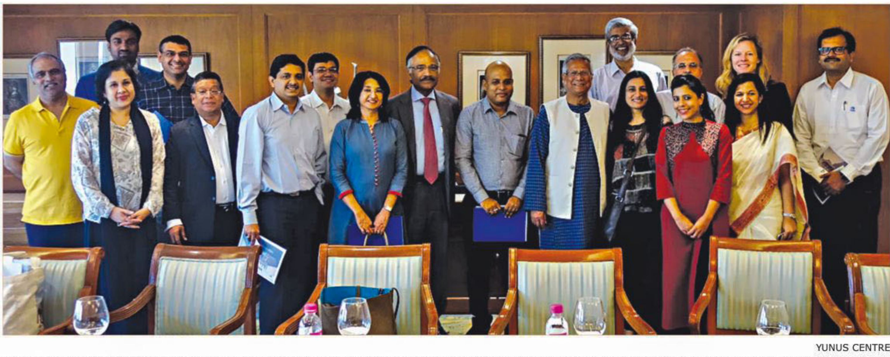
YUNUS CENTRE Nobel Laureate Professor Muhammad Yunus along with the CEOs of Tata companies poses after a meeting in Mumbai. They discussed how the Tata companies can get involved in creating social businesses through each company.

STAR BUSINESS REPORT Yunus Social Business in India and Tata Trusts have jointly rolled out an initiative—Indian Corporate Action Tank (ICAT)—in Mumbai to create corporate social businesses in a bid to address social issues such as nutrition, healthcare, sanitation and housing.