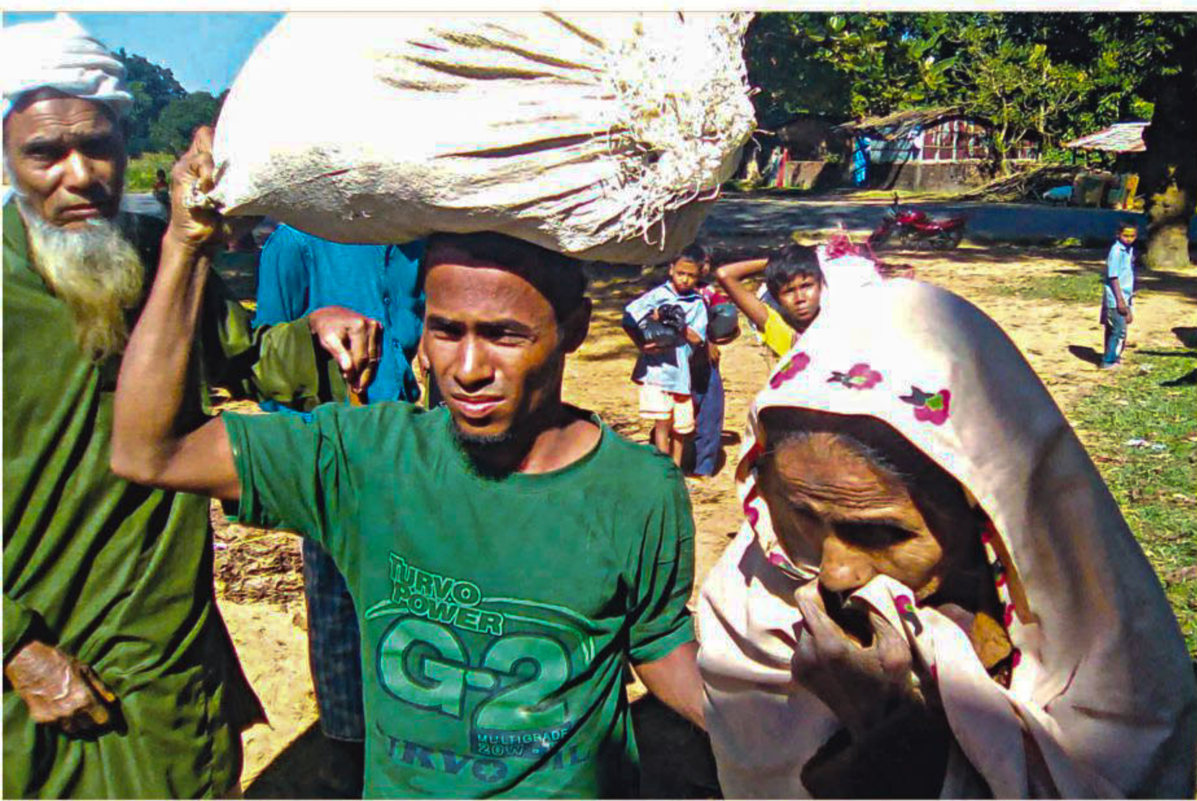
A Rohingya youth and his mother near an unregistered Rohingya camp in Cox's Bazar's Ukhia upazila yesterday. Many like them are entering Bangladesh by crossing the Naf river to escape persecution in Myanmar.