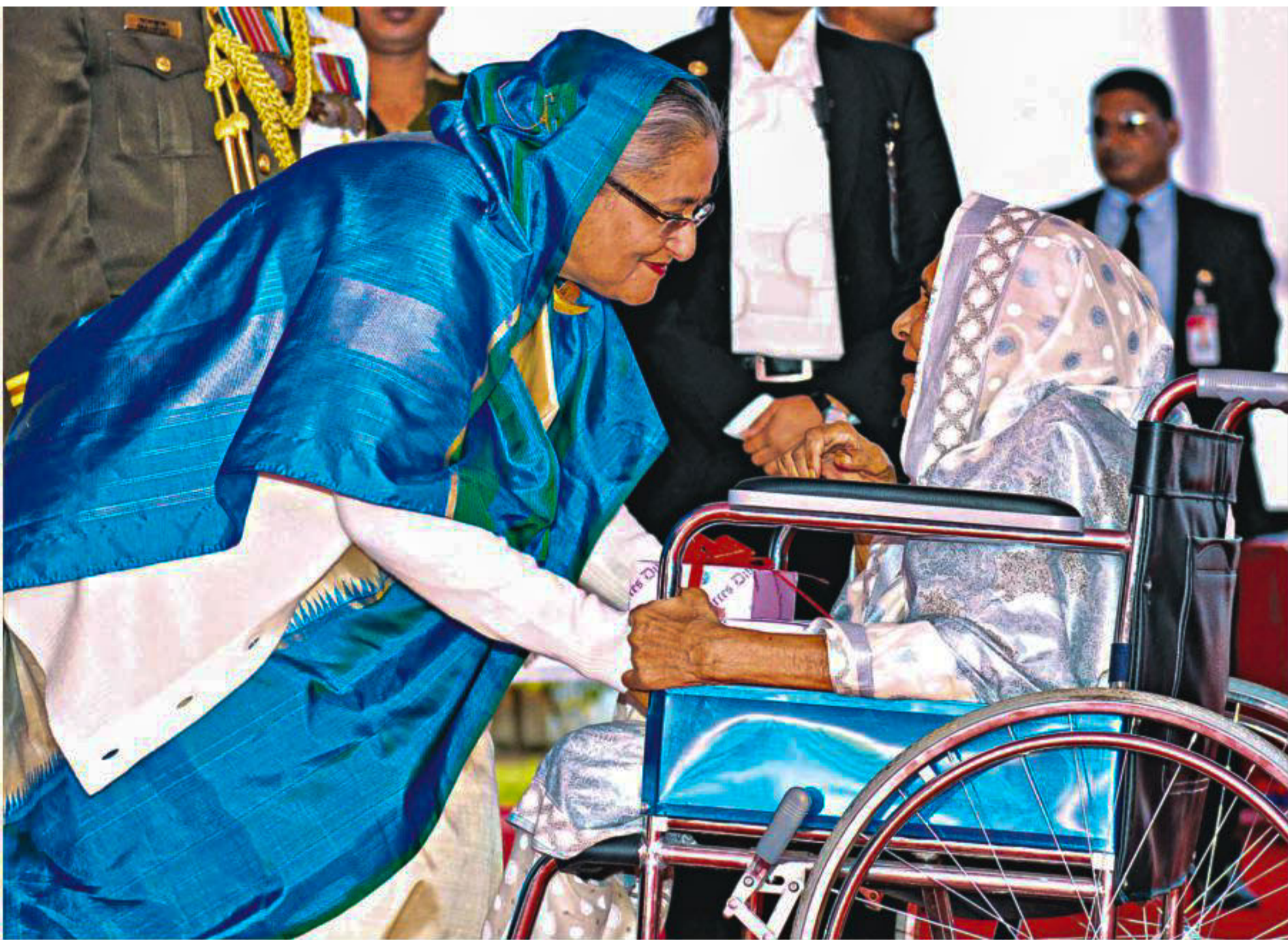
Prime Minister Sheikh Hasina talks to a woman on stage at a reception accorded to the gallantry award winning freedom fighters and their family members at Dhaka Cantonment yesterday. The programme was organised to mark the Armed Forces Day 2016.