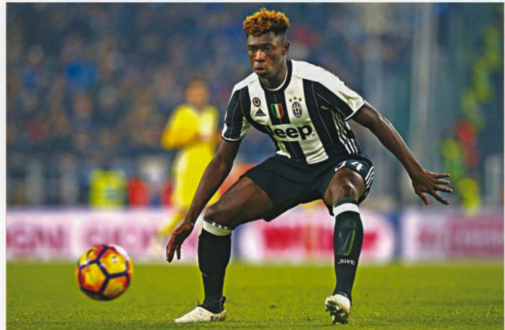
Juventus showed a glimpse of their 16-year-old prospect, Italian forward Moise Kean, in a comfortable win over Pescara at the Juventus Stadium in Turin on Saturday.

"I could see it in the way he reacted after hitting his first goal. He was reborn and about to become very dangerous every time he touched the ball."