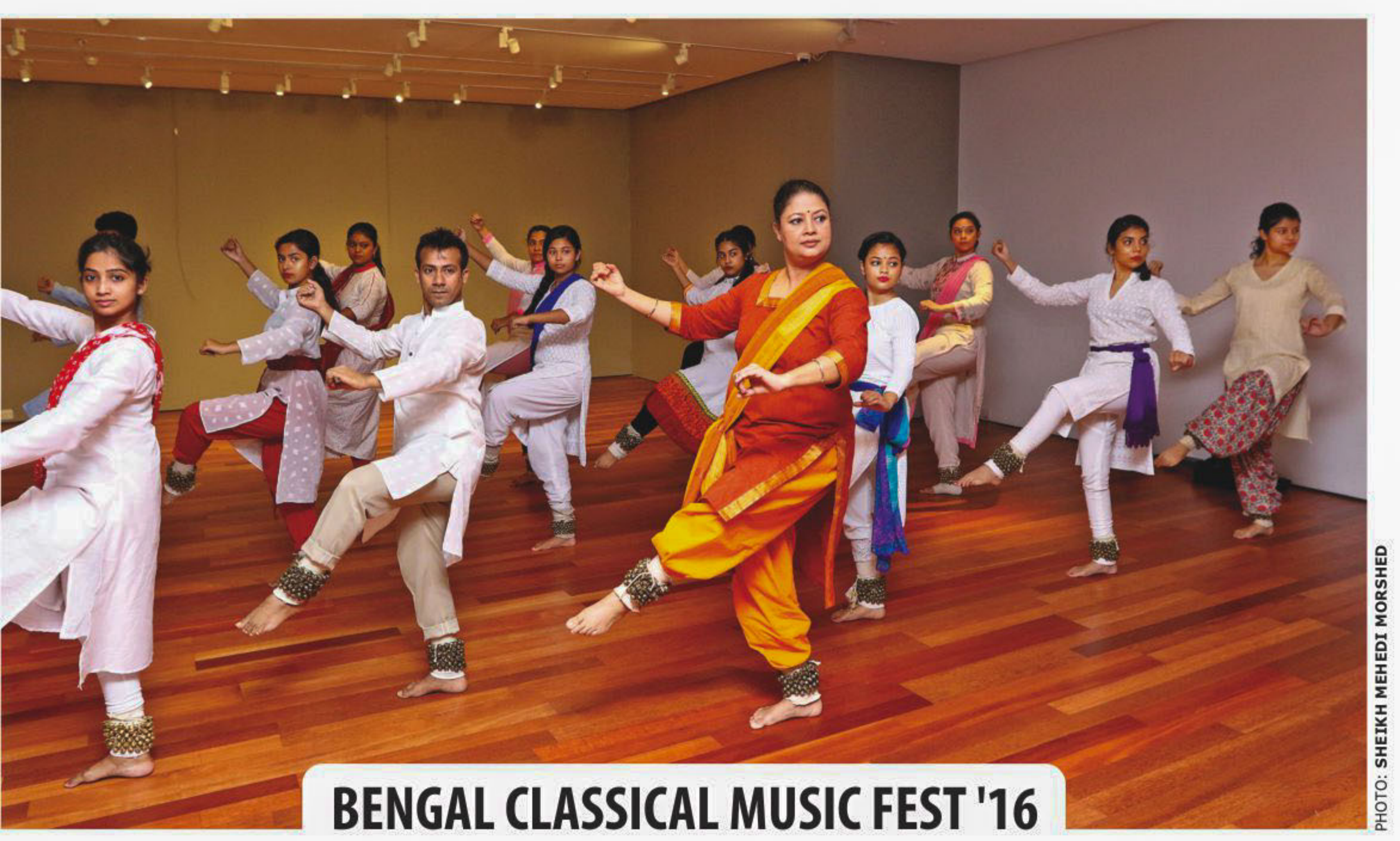
BENGAL CLASSICAL MUSIC FEST '16