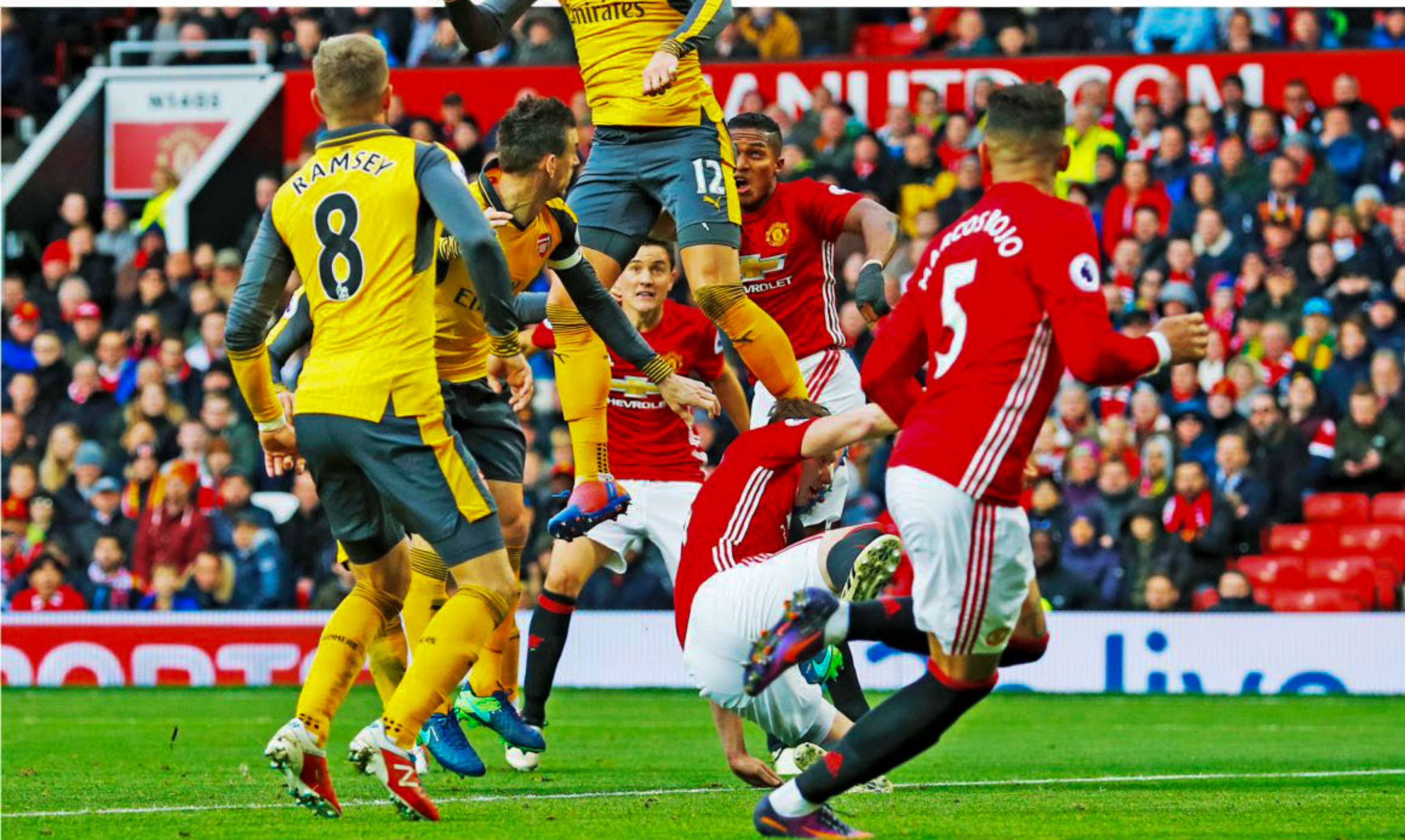
Arsenal striker Olivier Giroud rose high and equalised in spectacular fashion during the dying moments of his side's Premier League encounter against Manchester United at Old Trafford yesterday.