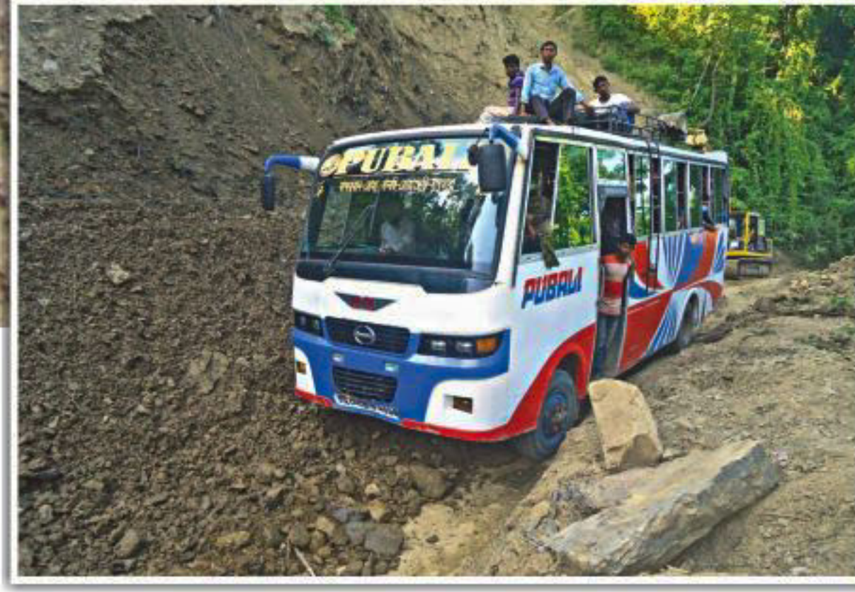
The muddy and pothole-riddled Bandarban-Ruma road has become virtually unusable for vehicles. The 29km road connecting Boga Lake and Rijuk waterfall, two popular tourist destinations in the hill district, has been in bad shape for long, thanks to negligence by the authorities. Inset, a bus plying the road despite risks. The photos were taken recently.