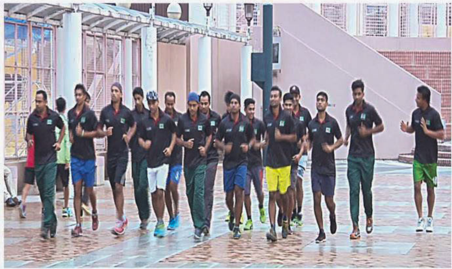
Players of the Bangladesh national hockey team go through a light jogging session at the Kowloon Park in Hong Kong yesterday ahead of today's match of the 5th AHF Cup against the hosts. Pitted in Pool A, Bangladesh will also play against Chinese Taipei and Macau in the group phase.

He was also capped 114 times by England, making him his country's fourth-most-capped player.