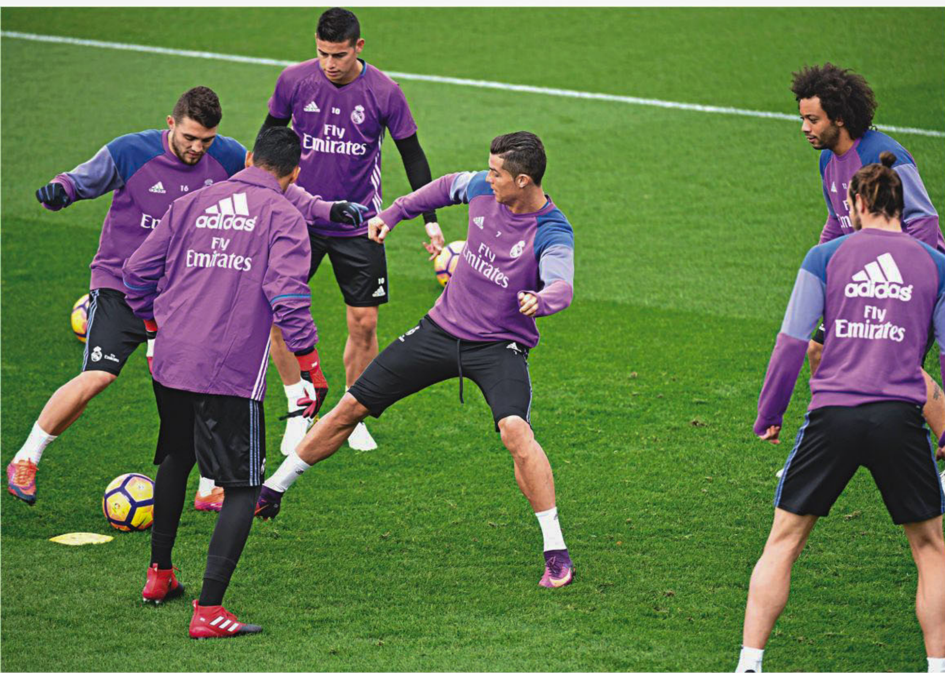
Real Madrid will be hoping to notch up a first league win over local rivals Atletico Madrid since 2013 as the two sides face off in the Madrid derby on Saturday.

Abahani v Muktiyoddha Time: 6:15pm Venue: MA Aziz Stadium, Chittagong