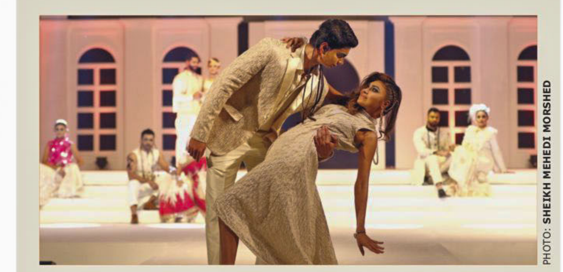
Two models strike a pose on the ramp at the opening night of the first International Weavers' Festival on Thursday, at the Army Museum field. The three-day festival organised by TS Events that ends today, also features discussions, showcase of various traditional weaving crafts, documentaries and concerts.