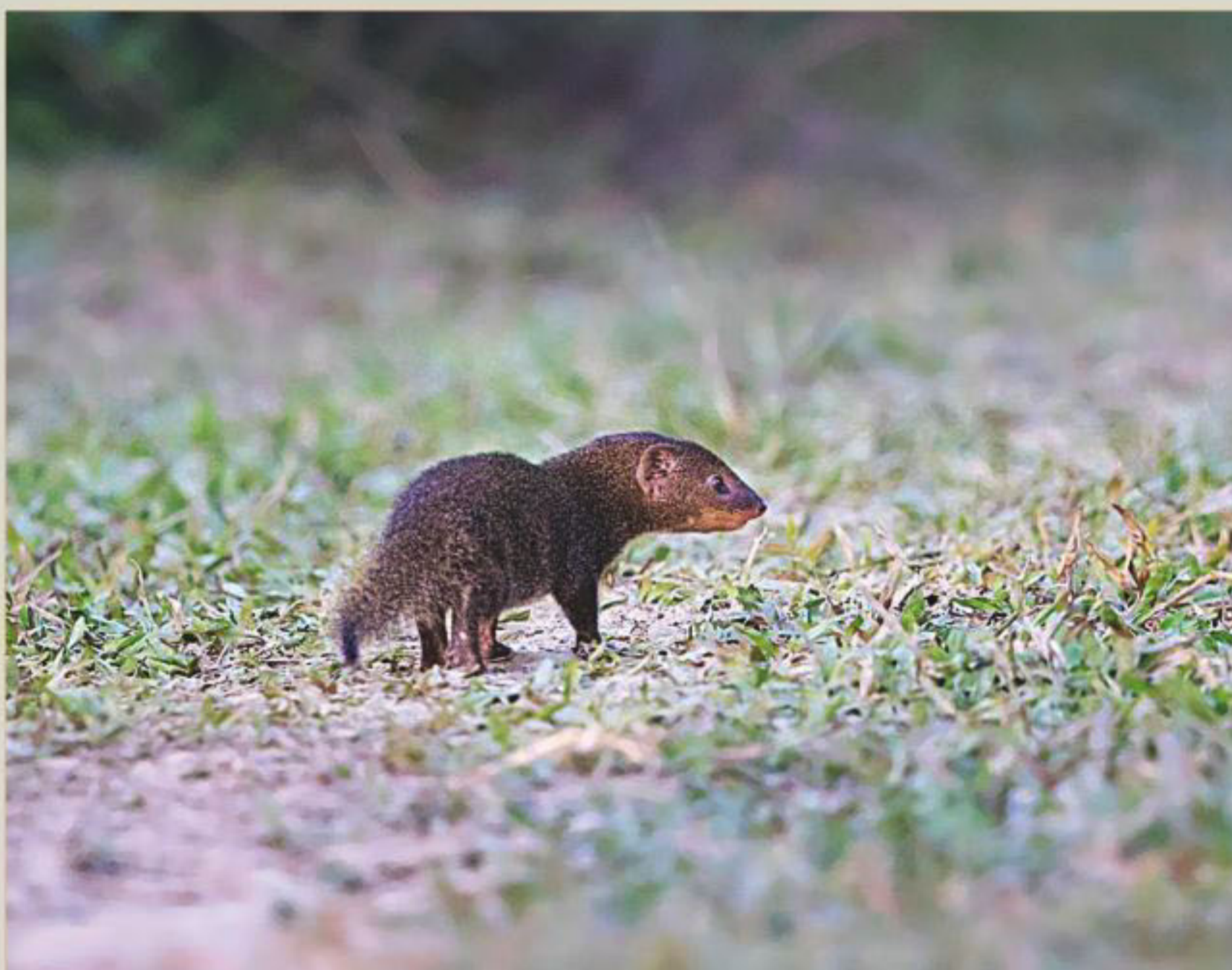
Mongoose in the Haor.