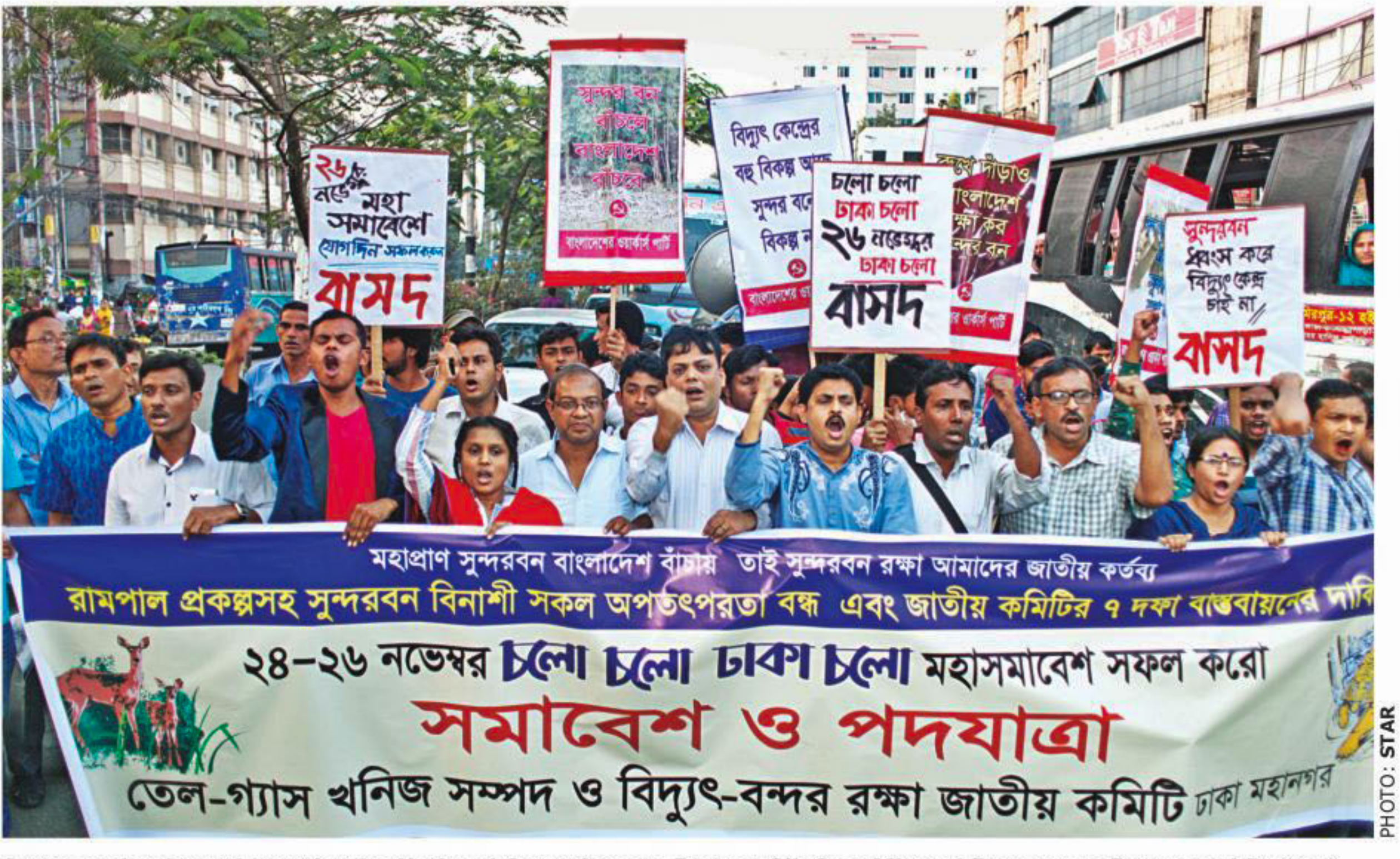
A procession brought out by the National Committee to Protect Oil, Gas, Mineral Resources, Power and Ports at Pallabi in the capital's Mirpur yesterday protesting the coal-based power plant in Rampal, near the Sundarbans.