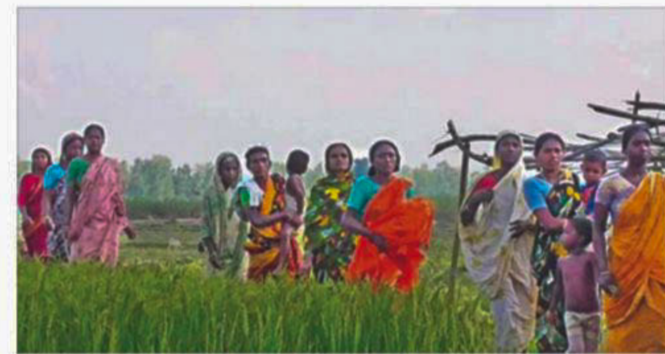
Evicted Santals now face acute food crisis Indigenous people evicted from the land of Rangpur Sugar Mill in Gobindaganj upazila of Gaibandha have been in dire straits

Violence of Bangladeshi State on minority and indigenous communities has to be confronted. This is a continues problem, which is too often overlook by mainstream folks