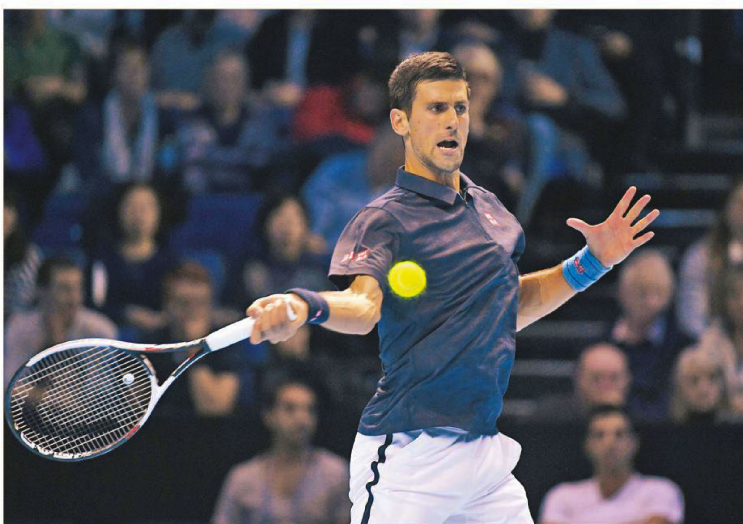
Novak Djokovic hits a forehand during his ATP World Tour Finals round robin match against David Goffin at the O2 Arena in London yesterday.

Herrera came on when Spain were trailing 2-0 but Isco and Iago Aspas scored in the dying minutes to earn the visitors a draw.