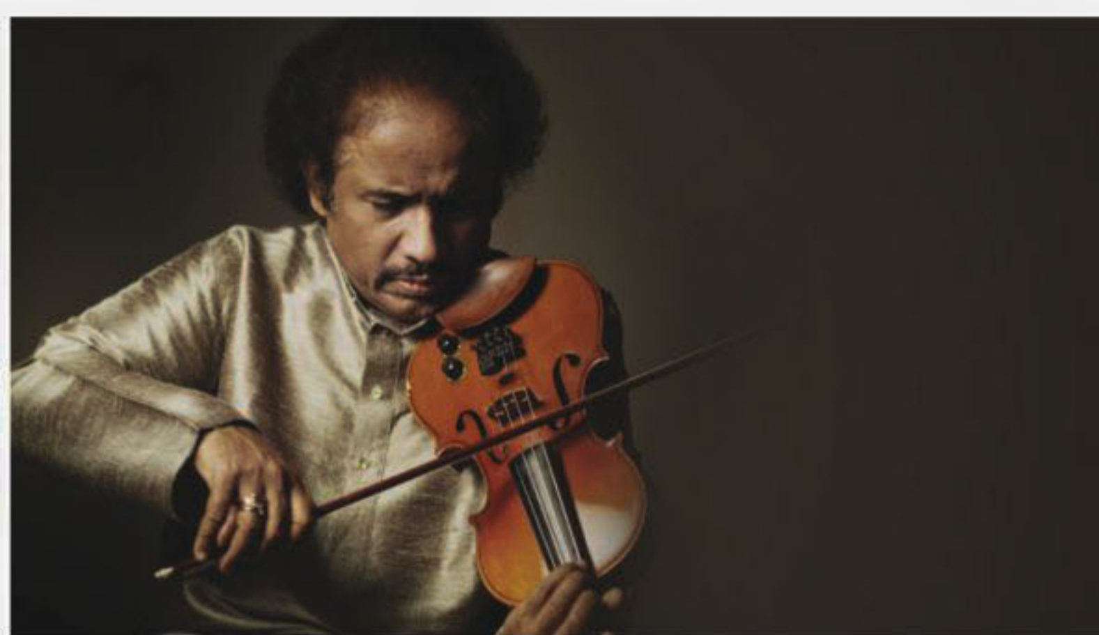
Dr. L. Subramaniam

The Bengal Classical Music Festival, in its last four editions, have introduced the Bangladeshi audience to the highest forms of vocal and instrumental classical music from this region of the world, be it Hindustani or Carnatic. Through the festival the audiences have been introduced to magnificent, ancient instruments like to Rudra Veena and Saraswati Veena to the thundering percussive clay pot, the ghatam, and many more. This year is no different, with some big names promising to bring some new magic to the largest classical music festival. Here is just a peek into what to expect: