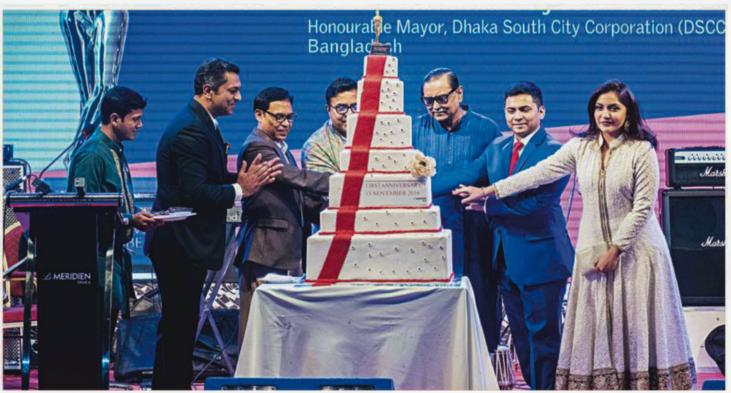
Tourism and Civil Aviation Minister Rashed Khan Menon and Mayor of Dhaka South City Corporation Sayeed Khokon celebrate the first anniversary of Le Meridien Dhaka on Tuesday.