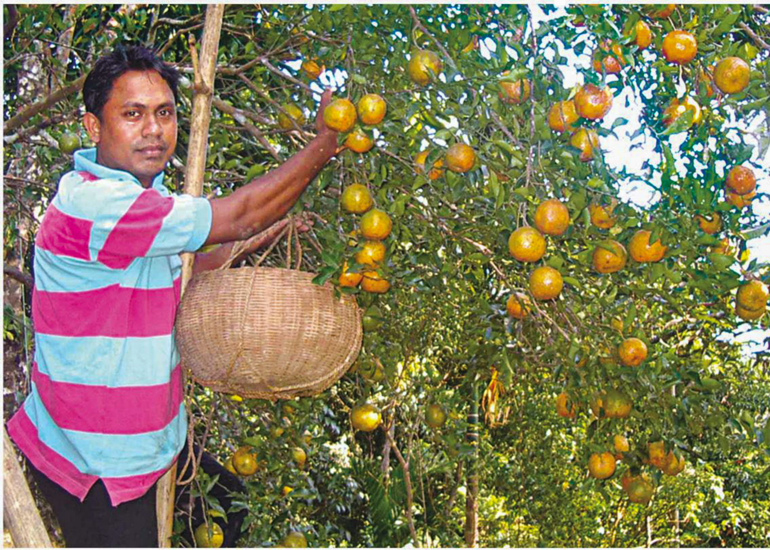
A mandarin grower at his orchard in Moulvibazar's Juri upazila. Cultivation of this sweet citrus fruit, locally called "komola", has become a boon for farmers of the district.