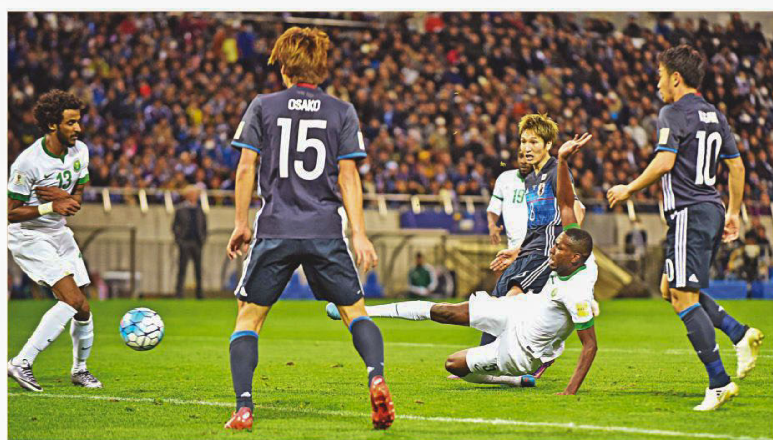
Japan forward Genki Haraguchi (C) scores the winning goal against Saudi Arabia during their 2018 World Cup qualifier at the Saitama Stadium yesterday.

Mueller has yet to score for Bayern Munich in the Bundesliga this season in an unusually long goal drought after netting 20 times last season.