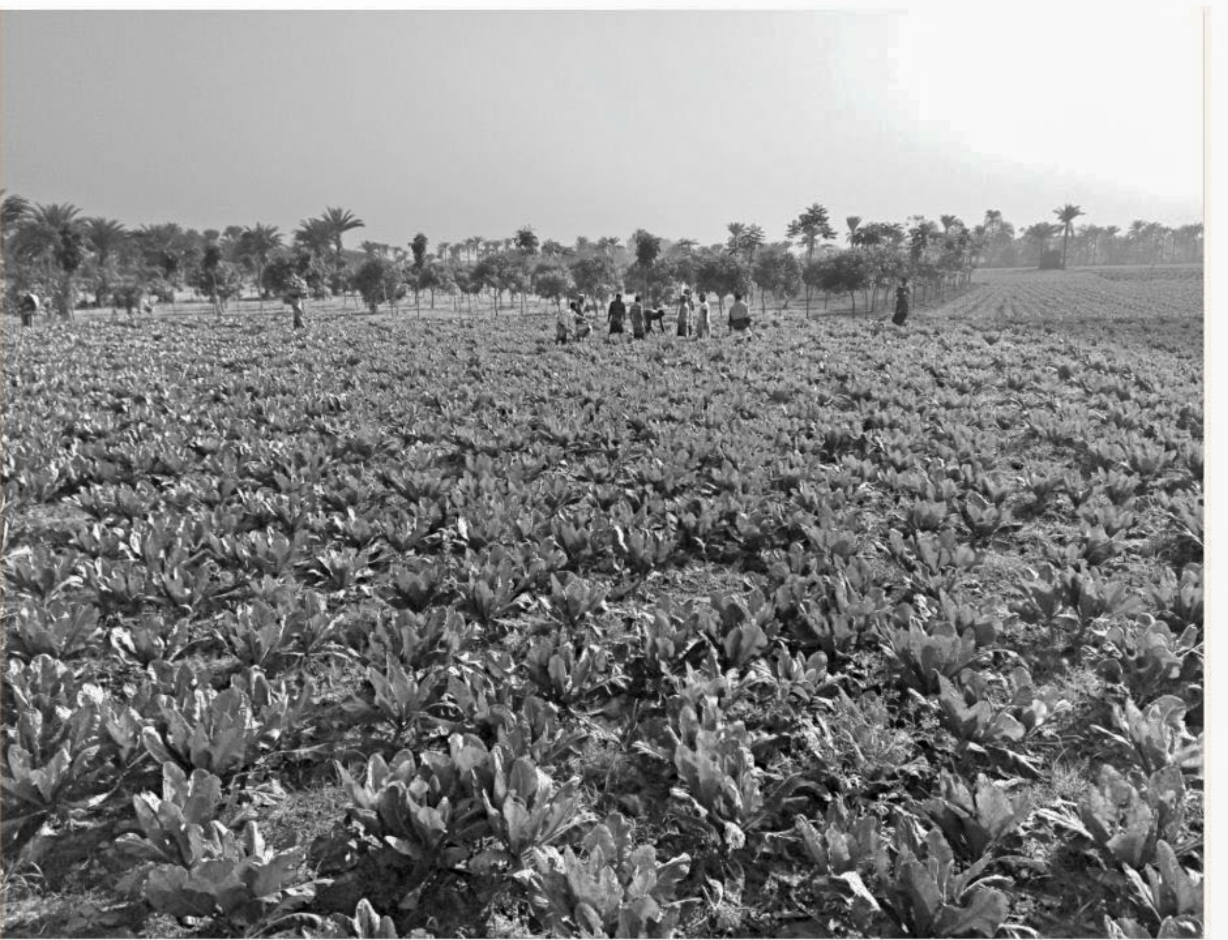
Mature early winter cauliflowers at a field in Chuadanga Sadar upazila.

Executive Engineer Sajedur Rahman said overloaded trucks and 10-wheel trucks are responsible for the vulnerable condition of the road. "We repair the roads, but they get damaged again as over-loaded vehicles move on them," he said.