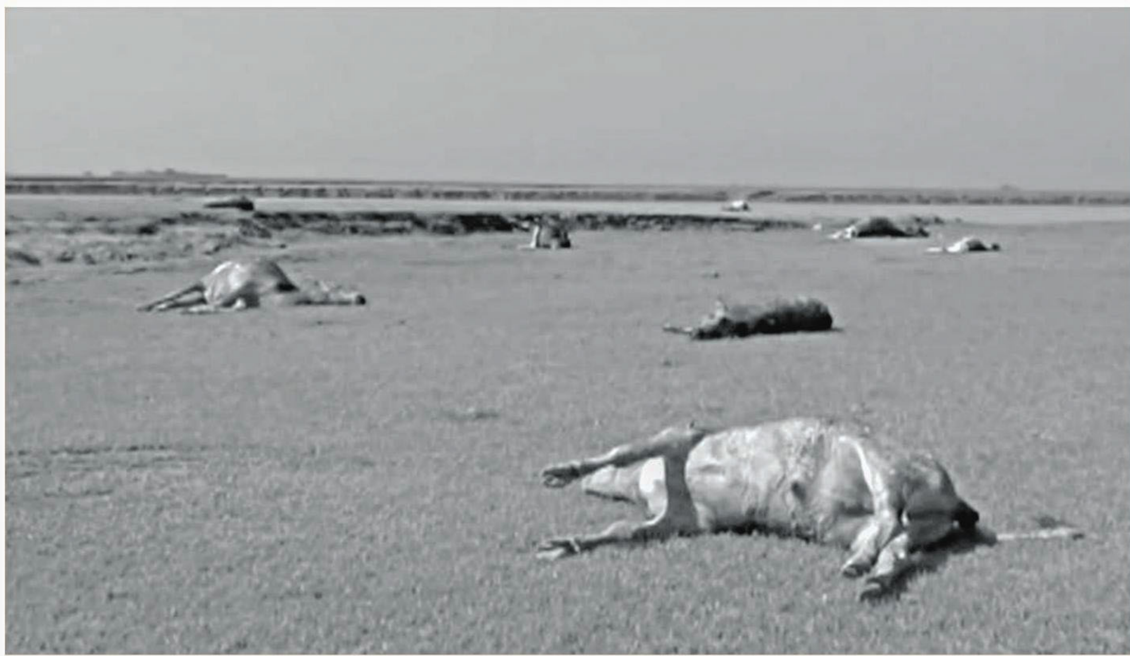
Carcasses of cattle that died of diseases due to incessant rain and cold under the impact of recent cyclone Nada in the Bay lie scattered in a remote char area of Noakhali.

Though livestock officials claimed that four teams were working in the area, many locals said no veterinarian had gone there as of yesterday.