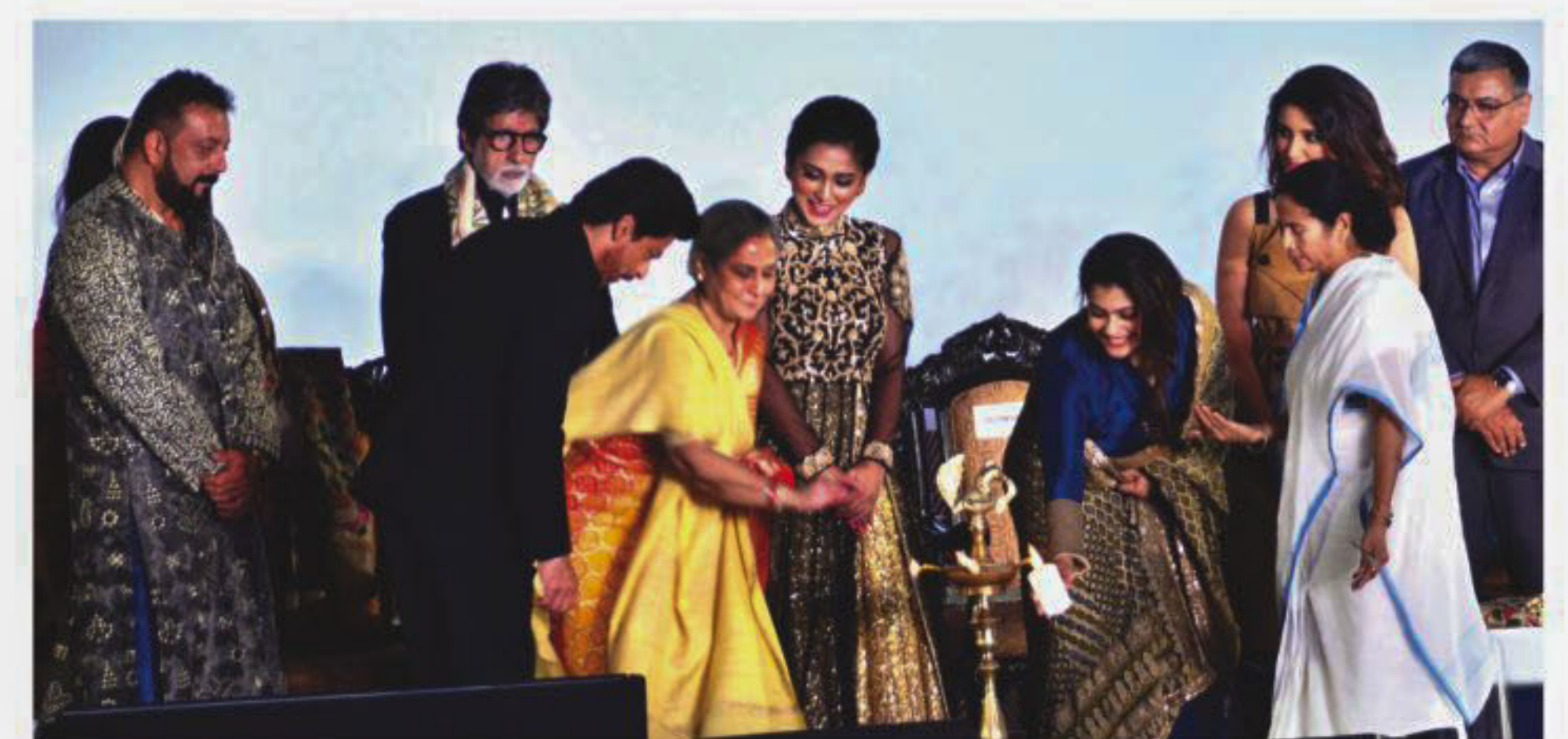
Sanjay Dutt, Amitabh Bachchan, Shah Rukh, Jaya Bachchan, Kajol and Parineeti with Mamata Banerjee at the inauguration.