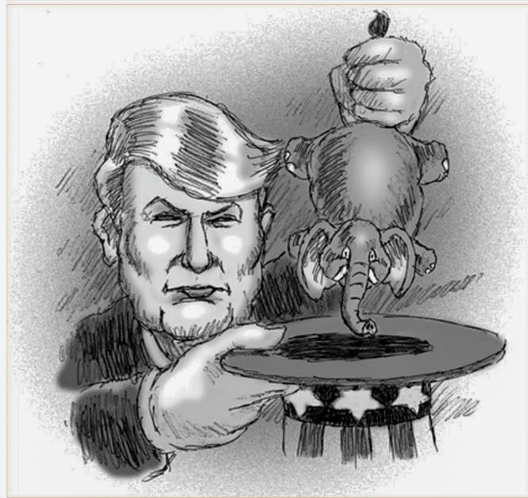
ILLUSTRATION: PETER C