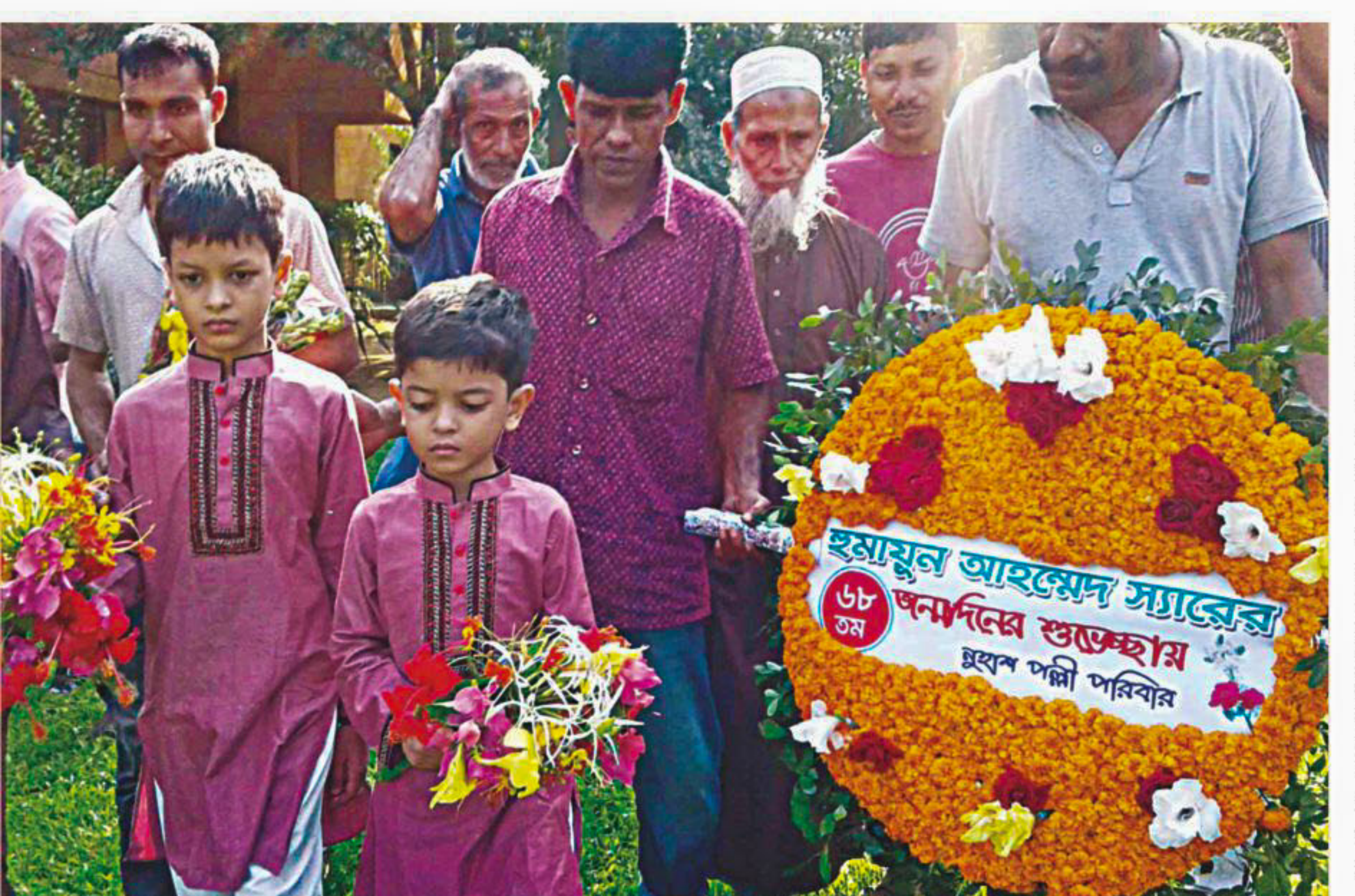
Two sons of Humayun Ahmed, accompanied by others, placing floral wreaths at his grave in Gazipur's Nuhash Polli yesterday, marking the celebrated novelist's 68th birthday.

The court directed officer-in-charge of Paltan Police Station to submit by January 22, 2017 reports on execution of arrest warrants against the fugitives.