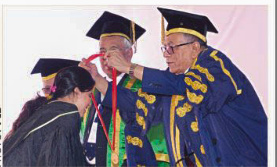
President awarding a gold medal to a student of Mawlana Bhashani university.

Meanwhile, mentioning that Bangladesh is a country of communal harmony, President Abdul Hamid, at another programme the same day, called upon the young generation to move forward upholding this image. Hamid was addressing the second convocation of