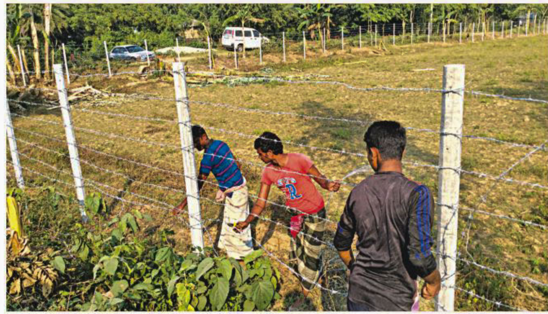
Barbed-wire fence being installed around the "sugarcane farm" in Gobindaganj of Gaibandha. The Santal people of the area want the land back.

Like these 10-12 Santals, most of those who were evicted a week ago from the disputed land of Shahebganj Sugar Mill in Gobindaganj of Gaibandha didn't seem SEE PAGE 2 COL 1