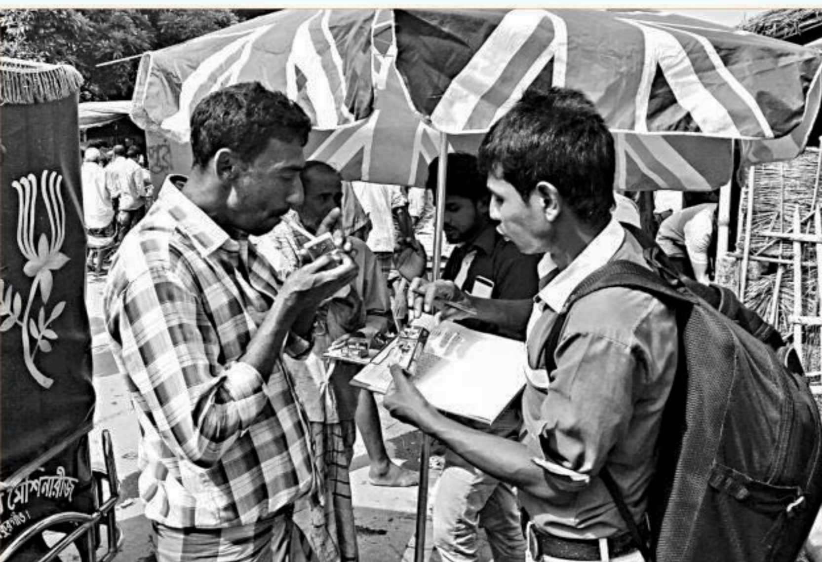
Flouting government rules, representatives of different tobacco companies conduct open campaign in favour of their brands, including offering of free sticks to have a taste. The photo was taken from Nekmarad Haat in Ranishankoil upazila under Thakurgaon a few days ago.