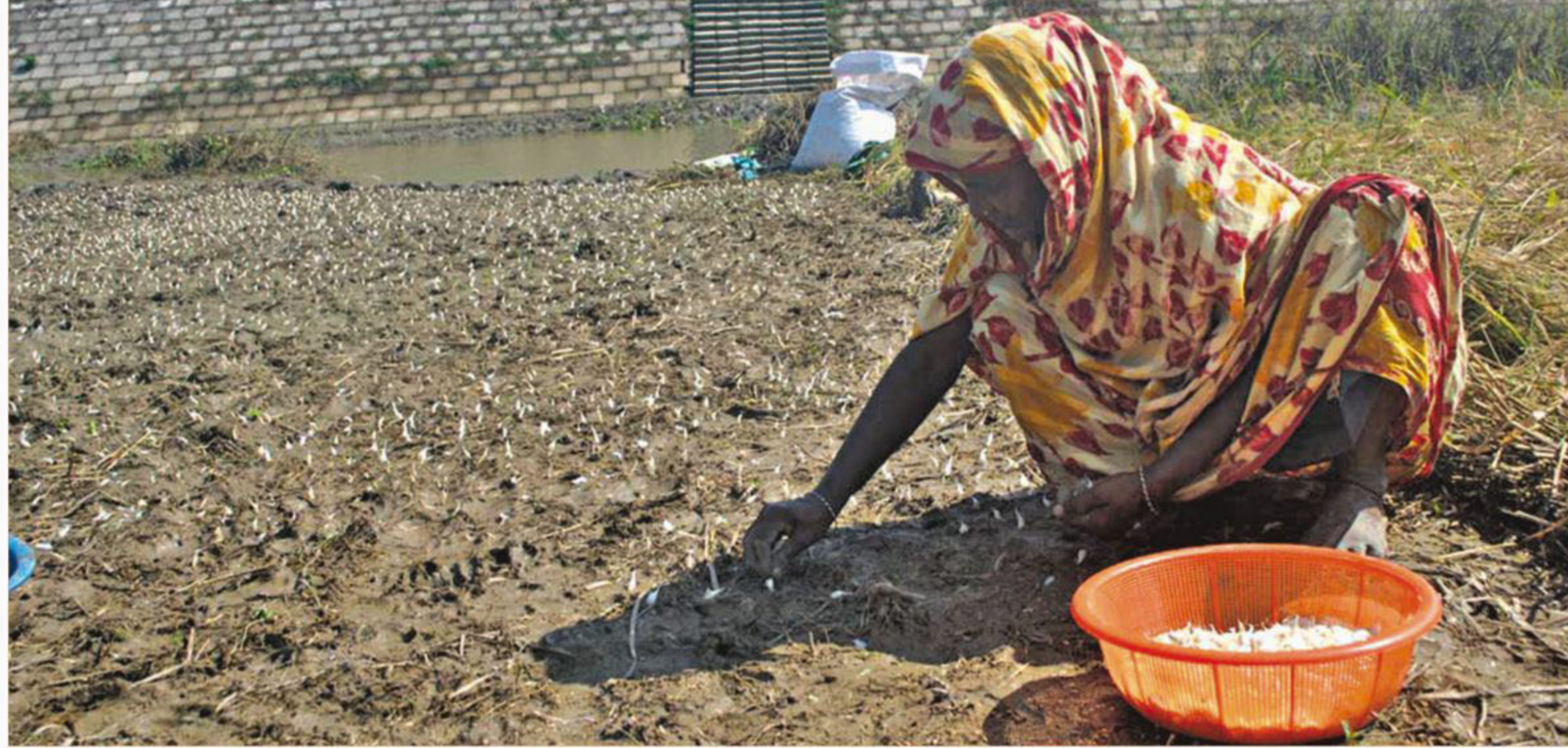
A female farmer planting garlic in a field in Bogra's Chatmohar upazila, and turmeric and ginger fields inside the Spice Research Centre in the district, above. Spice production in Bangladesh increased six-fold in the last 20 years, thanks to the centre which developed high-yielding varieties of spices. The photos were taken recently.