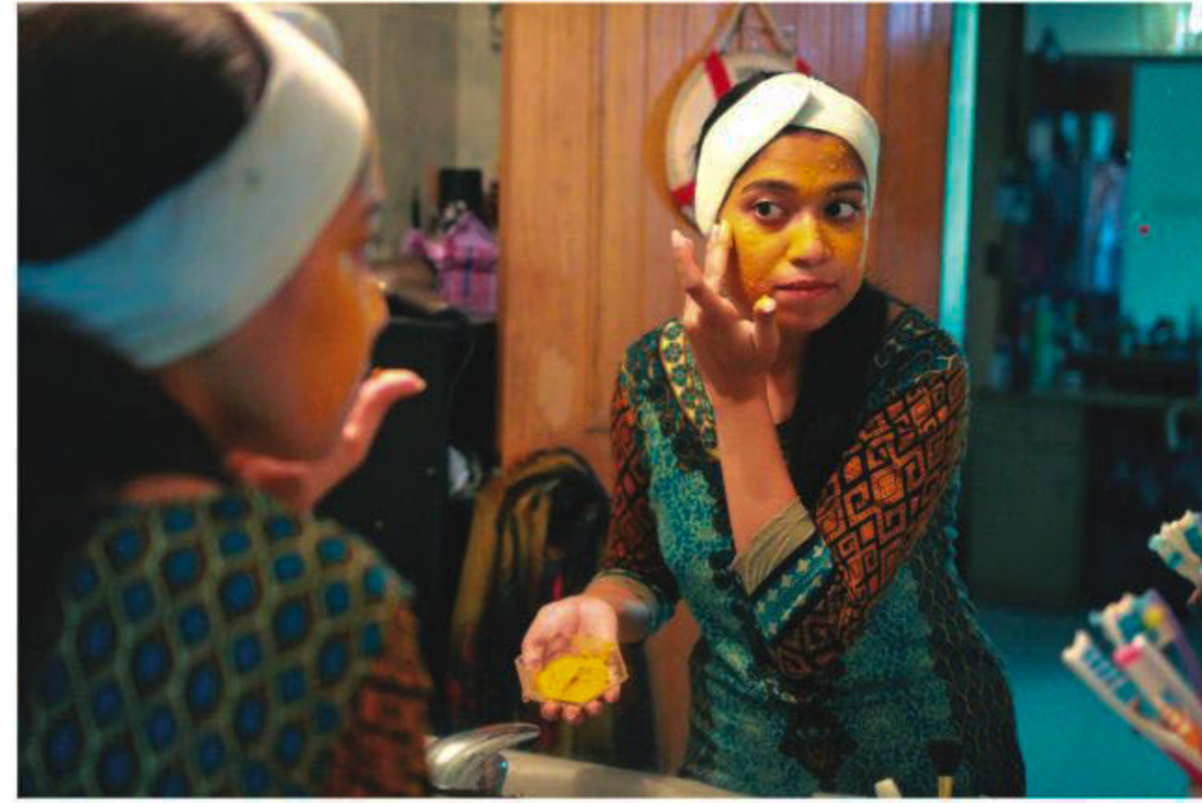
AN APPLE A DAY!