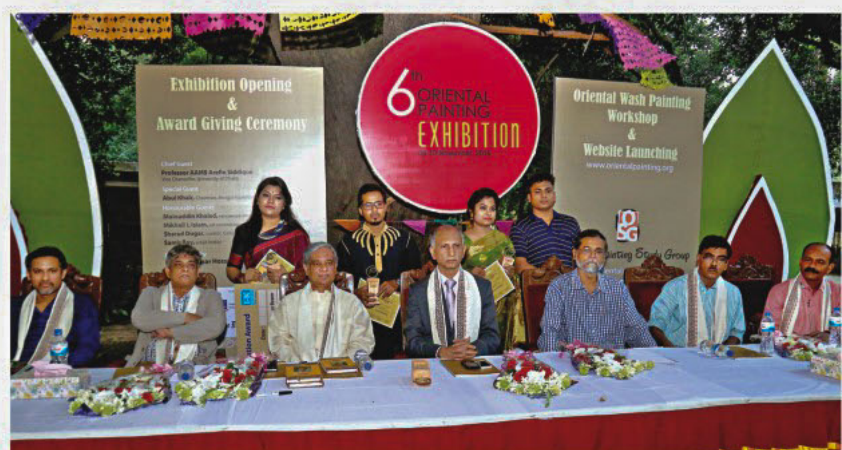
Award recipients (back) with the guests at the event.