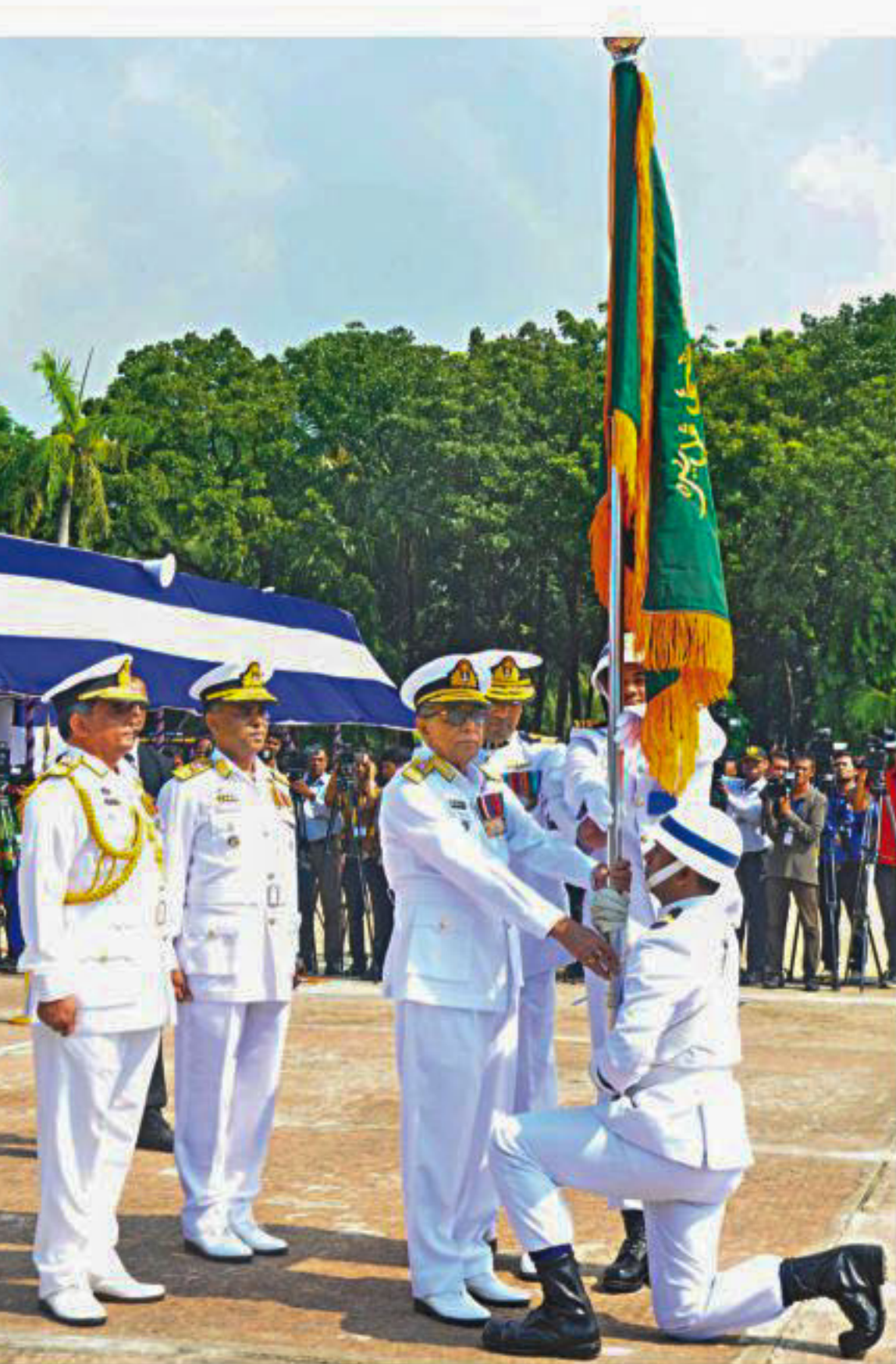
President Abdul Hamid awards National Standard to BNS Base Issa Khan of Bangladesh Navy in Chittagong yesterday.

Members of parliamentary standing committee on the Ministry of Defence, the chiefs of army and air force, and civil and military officials were present.