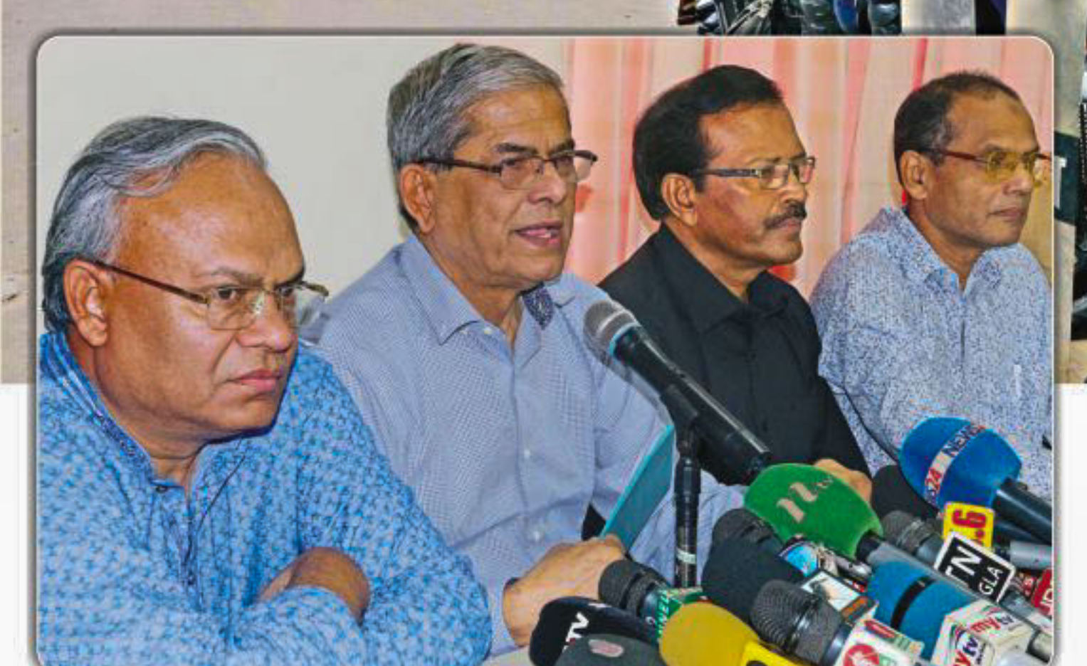
A considerable number of law enforcers deployed outside BNP's Nayapaltan headquarters in the capital yesterday, when the party was barred by police from using Surawardy Udyan to stage a rally marking "National Revolution and Solidarity Day". Inset, BNP Secretary General Mirza Fakhrul Islam Alamgir addresses a press conference at the headquarters.