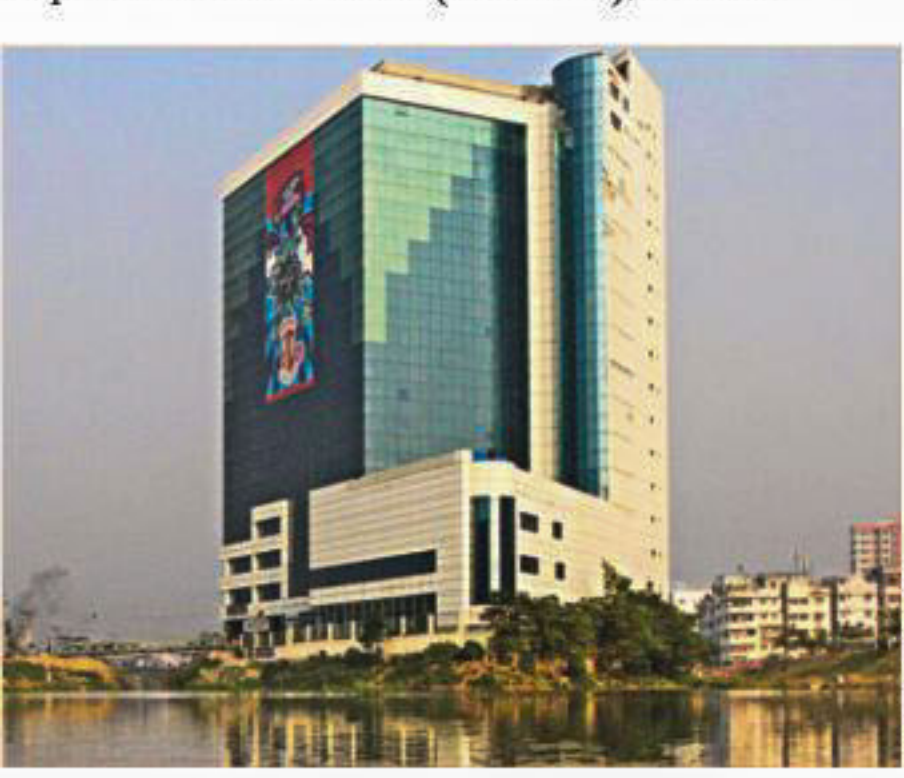
"BGMEA Complex" on Begunbari canal.

Otherwise, Rajdhani Unnayan Kartipakkha (Rajuk) will do it within 90 days of receiving the order and realise the cost from Bangladesh Garment Manufacturers and Exporters Association (BGMEA), it said.