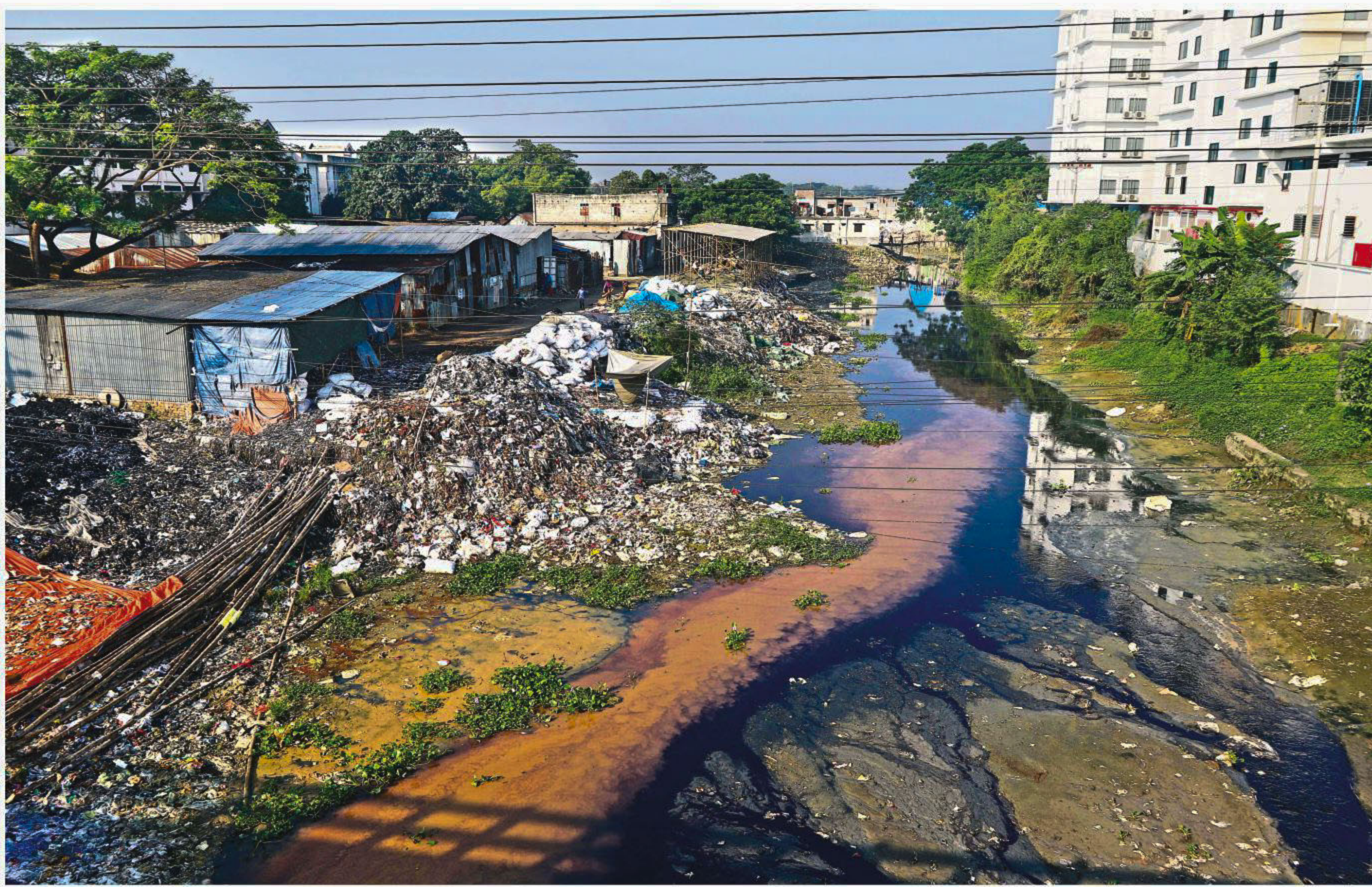
The slow death of Kornopara canal beside the Savar Bank Town with factory waste polluting it and depositing sediment while discarded solid waste, a pile of bamboo (bottom left) and an under-construction warehouse (top) tactfully encroach upon it. The photo was taken yesterday.