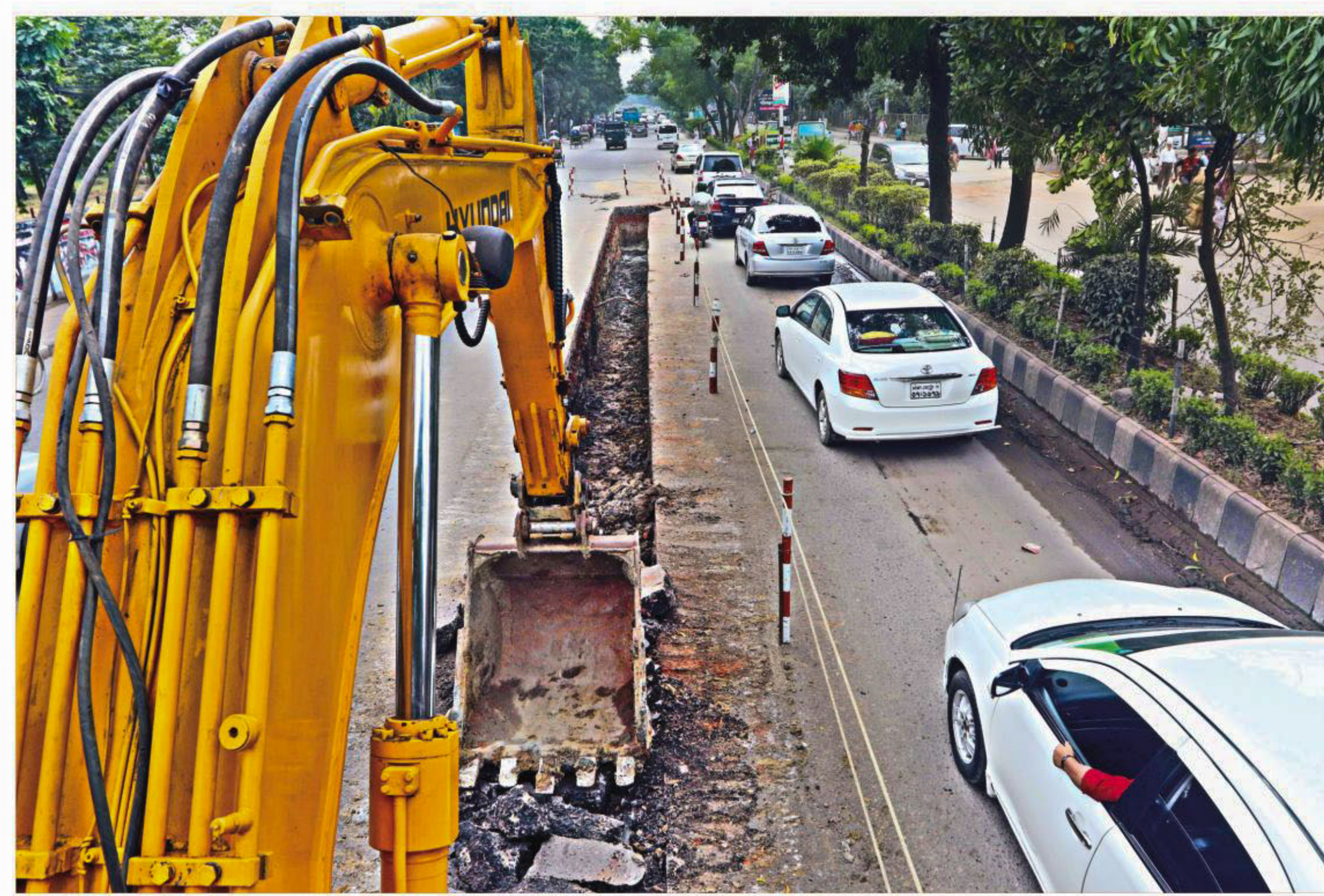
An excavator digs a trench on Begum Rokeya Sarani near IDB Bhaban in the city to relocate an underground 132kv power cable yesterday. The work is part of the metro rail construction project.