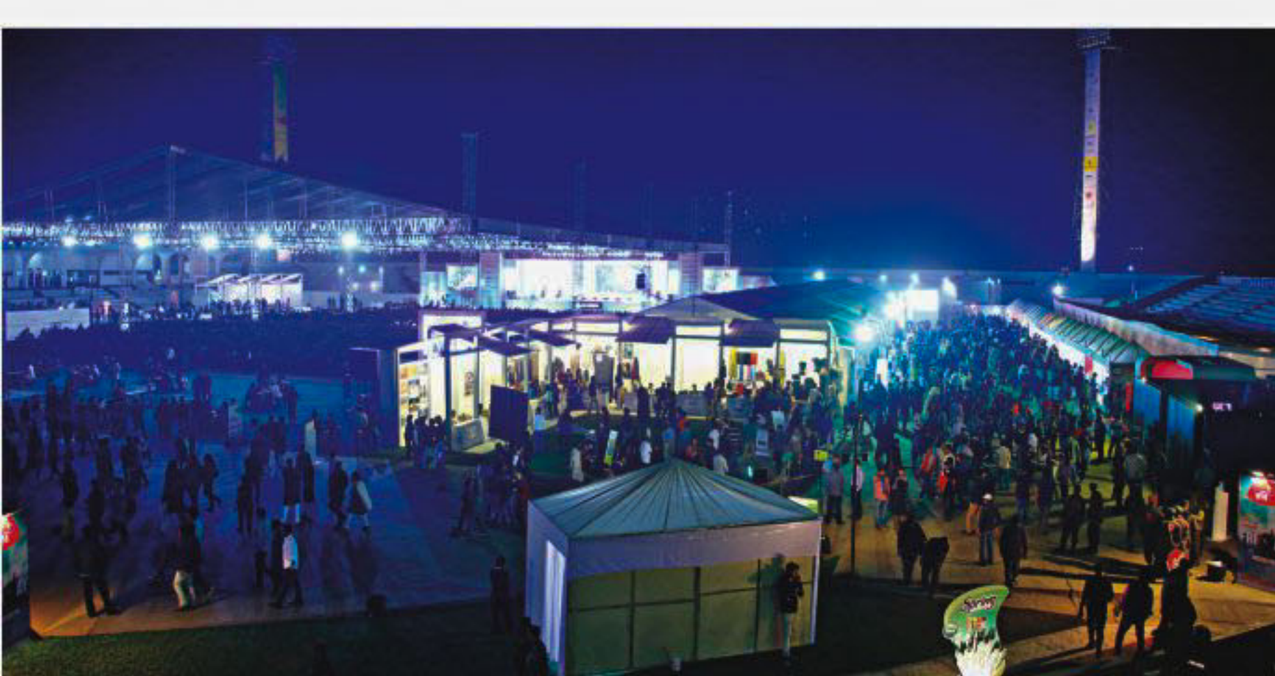
The festival has grown in stature and popularity over the years. FILE PHOTO